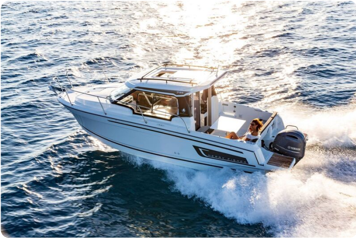
Jeanneau Merry Fisher 795 - on beautiful water