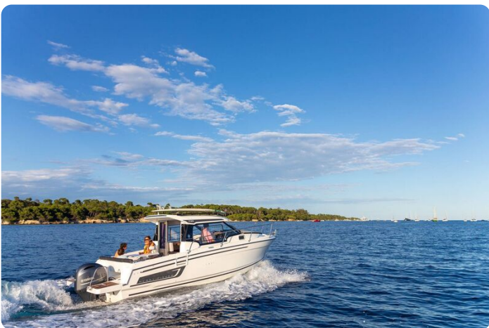
Jeanneau Merry Fisher 795 - on the water