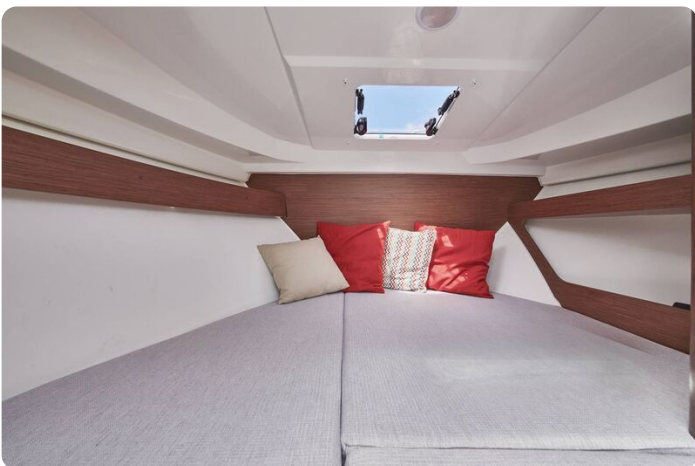
Jeanneau Merry Fisher 795 - double berth in forward cabin