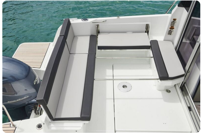
Jeanneau Merry Fisher 795 - U-shape cockpit seating