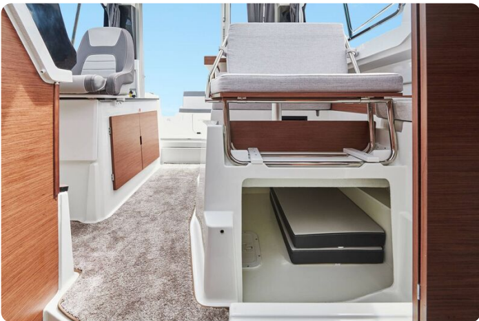
Jeanneau Merry Fisher 795 - storage under seating