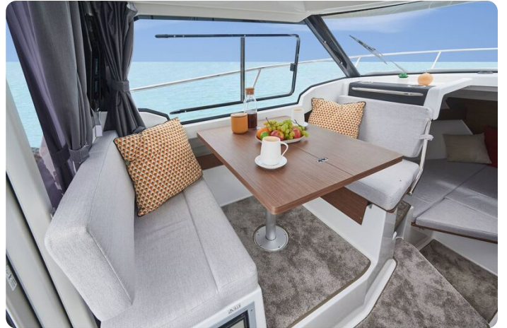
Jeanneau Merry Fisher 795 - wheelhouse saloon with table and seating