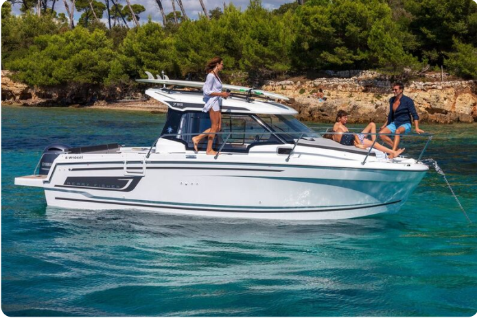
Jeanneau Merry Fisher 795