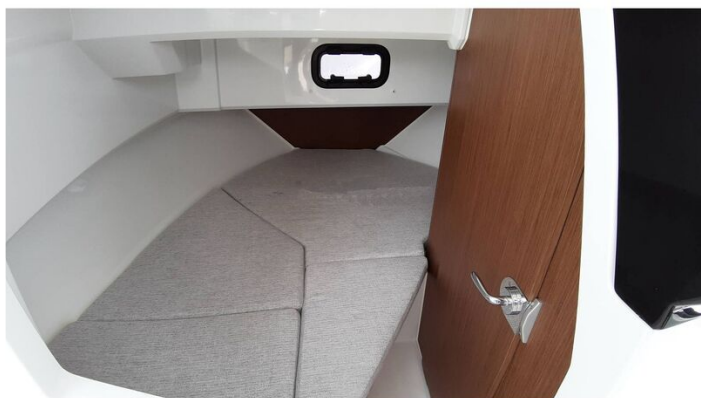
Jeanneau Merry Fisher 795 Sport - Series 2 - forward cuddy with cushions