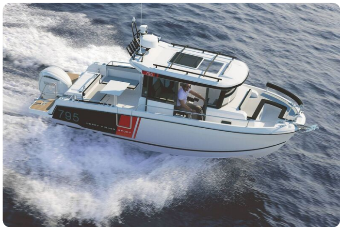
Jeanneau Merry Fisher 795 Sport - Series 2