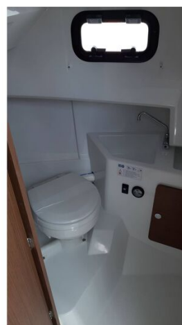
Jeanneau Merry Fisher 795 Sport - Series 2 - toilet compartment