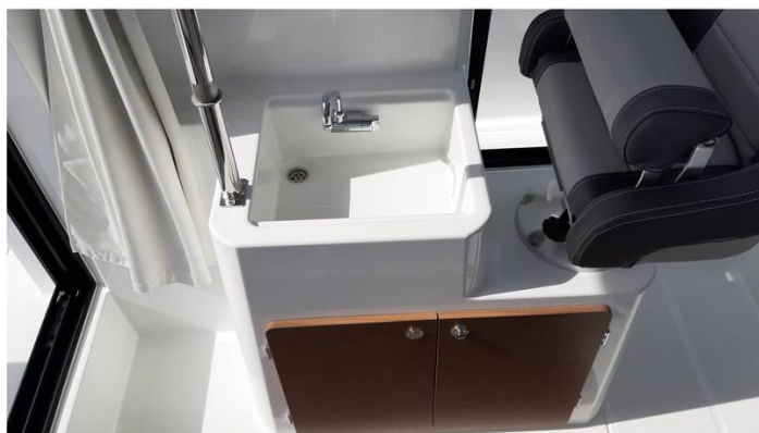
Jeanneau Merry Fisher 795 Sport - Series 2 - galley behind helm seat