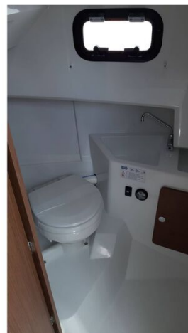
Jeanneau Merry Fisher 795 Sport - Series 2 - toilet compartment