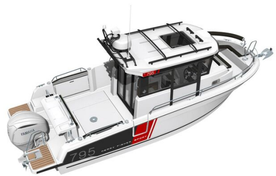
Jeanneau Merry Fisher 795 Sport - Series 2 - render of overhead view