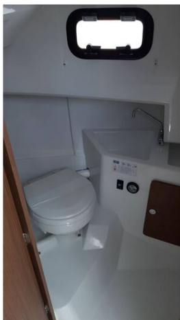
Jeanneau Merry Fisher 795 Sport - Series 2 - toilet compartment