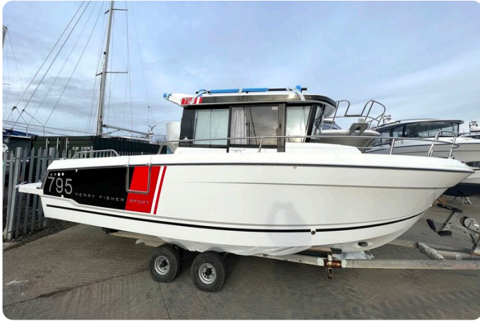
Jeanneau Merry Fisher 795 Sport - Series 2 - at Morgan Marine