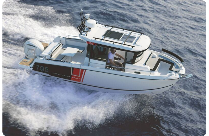
Jeanneau Merry Fisher 795 Sport - Series 2