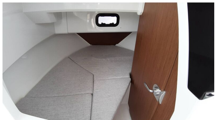
Jeanneau Merry Fisher 795 Sport - Series 2 - forward cuddy with cushions