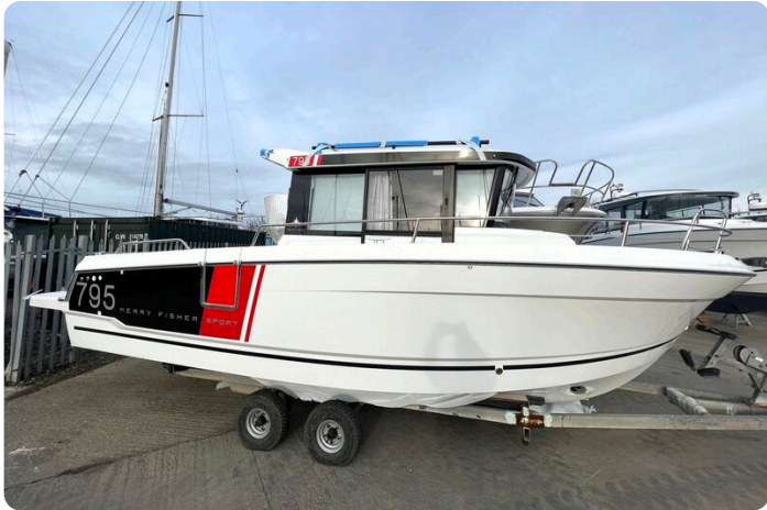
Jeanneau Merry Fisher 795 Sport - Series 2 - at Morgan Marine