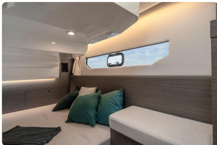
Jeanneau Merry Fisher 895 - aft cabin