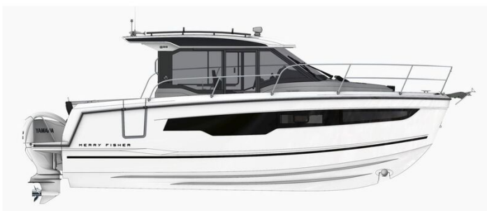
Jeanneau Merry Fisher 895 - diagram of starboard side