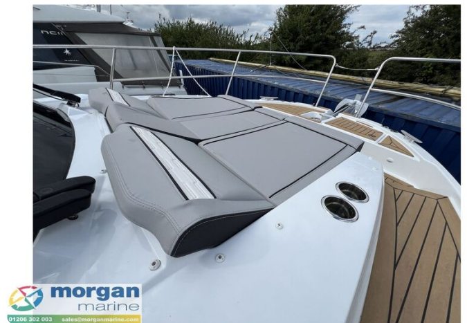
Jeanneau Merry Fisher 895 Series 2 - view from bow seating to pulpits rails