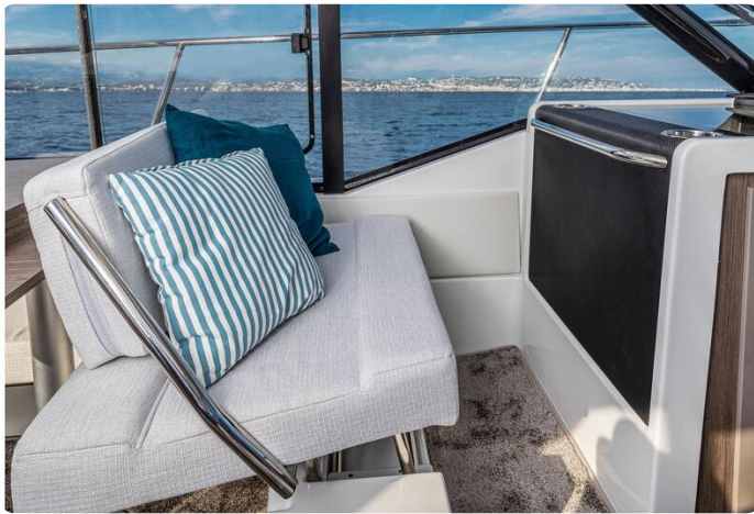
Jeanneau Merry Fisher 895 - co-pilot seat