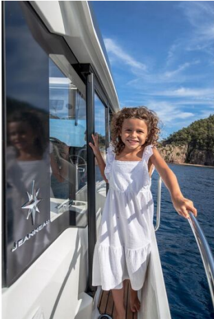
Jeanneau Merry Fisher 895 - deep and safe side decks