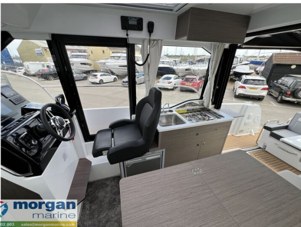
Jeanneau Merry Fisher 895 Series 2 - helm side door