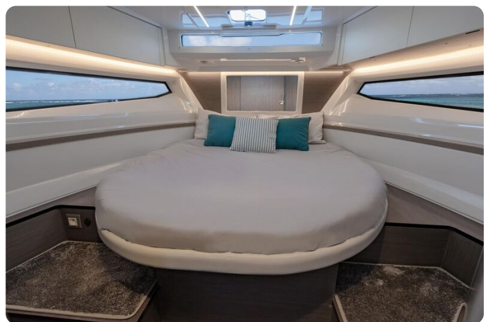
Jeanneau Merry Fisher 895 - forward cabin with double berth