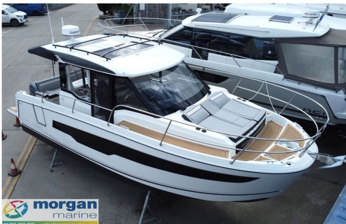
Jeanneau Merry Fisher 895 Series 2