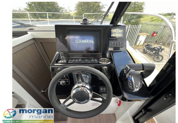
Jeanneau Merry Fisher 895 Series 2 - engine controls