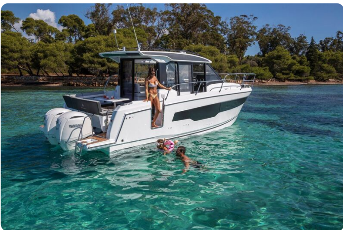
Jeanneau Merry Fisher 895 - wide boarding door on starboard side