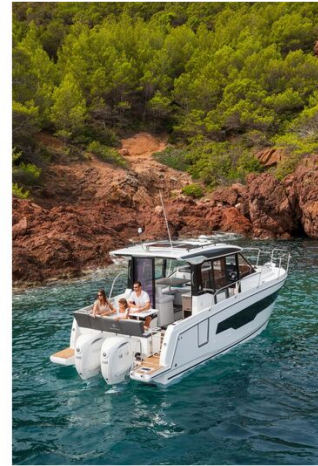
Jeanneau Merry Fisher 895 - in beautiful surroundings