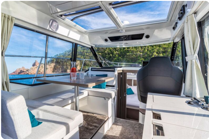
Jeanneau Merry Fisher 895 - wheelhouse with port side saloon and starboard side galley and helm position