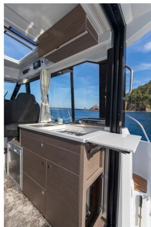
Jeanneau Merry Fisher 895 - starboard side galley