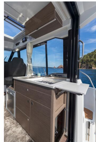
Jeanneau Merry Fisher 895 - starboard side galley