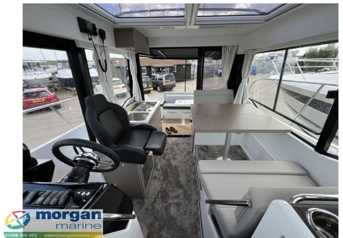
Jeanneau Merry Fisher 895 Series 2 - rotating helm seat