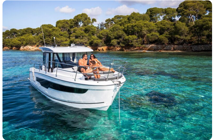
Jeanneau Merry Fisher 895 - relaxing on the forward sun lounger