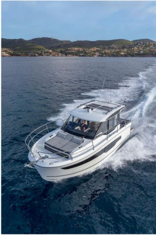
Jeanneau Merry Fisher 895 - on the water