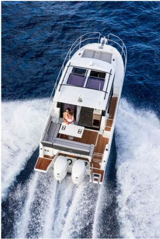
Jeanneau Merry Fisher 895 - overhead view