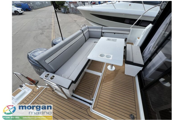
Jeanneau Merry Fisher 895 Series 2 - U shape cockpit seating and table