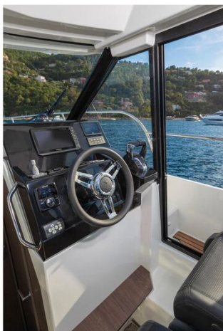
Jeanneau Merry Fisher 895 - helm position