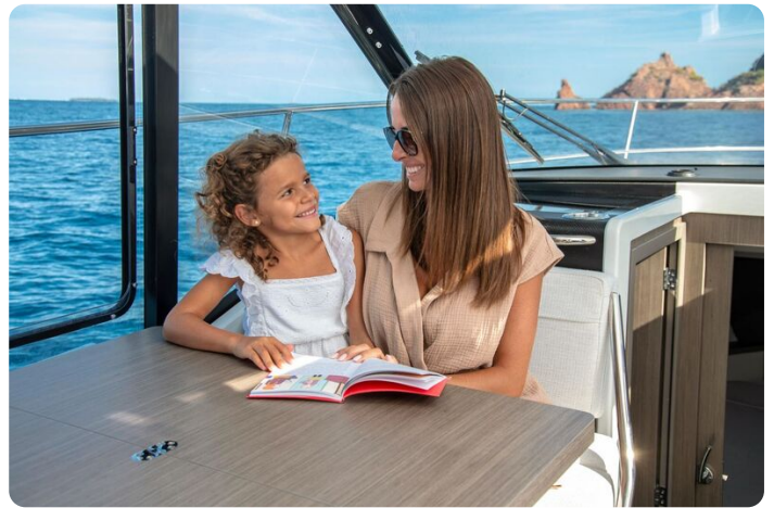
Jeanneau Merry Fisher 895 - sitting at the saloon table