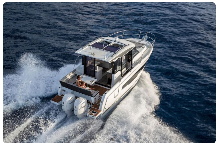
Jeanneau Merry Fisher 895 - overhead view from starboard side aft