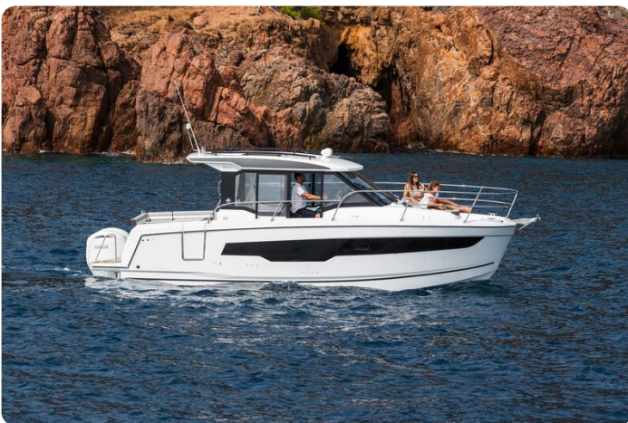
Jeanneau Merry Fisher 895 - on the water