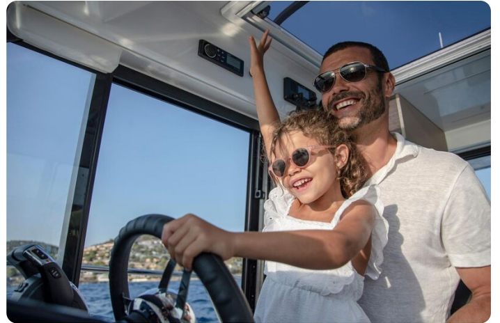
Jeanneau Merry Fisher 895 - sitting at helm position