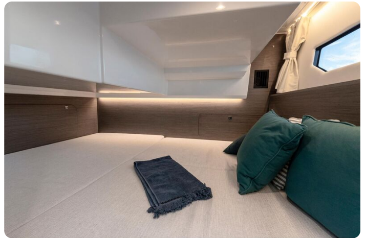
Jeanneau Merry Fisher 895 - double berth in aft cabin