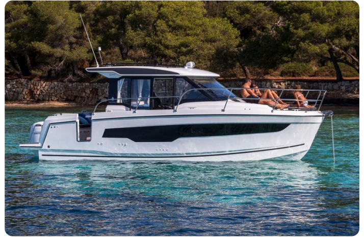
Jeanneau Merry Fisher 895 Series 2 - starboard side view on the water