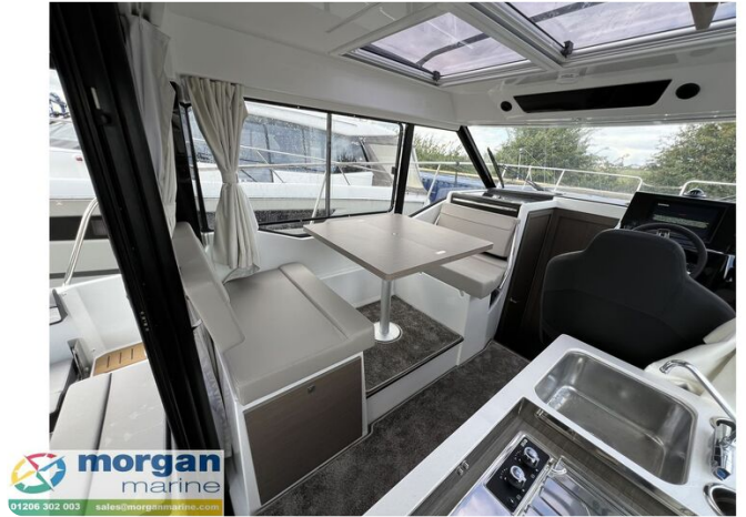
Jeanneau Merry Fisher 895 Series 2 - port side table