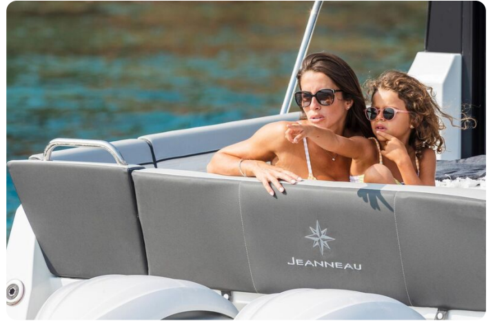
Jeanneau Merry Fisher 895 - people looking out over the aft cockpit bench seat