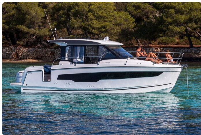
Jeanneau Merry Fisher 895 Series 2 - starboard side view on the water