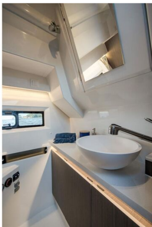
Jeanneau Merry Fisher 895 - toilet compartment