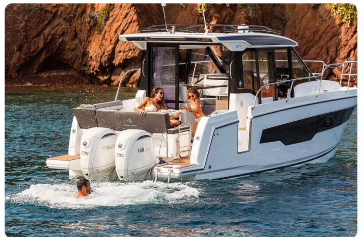
Jeanneau Merry Fisher 895 - transom with twin engines and swim platforms