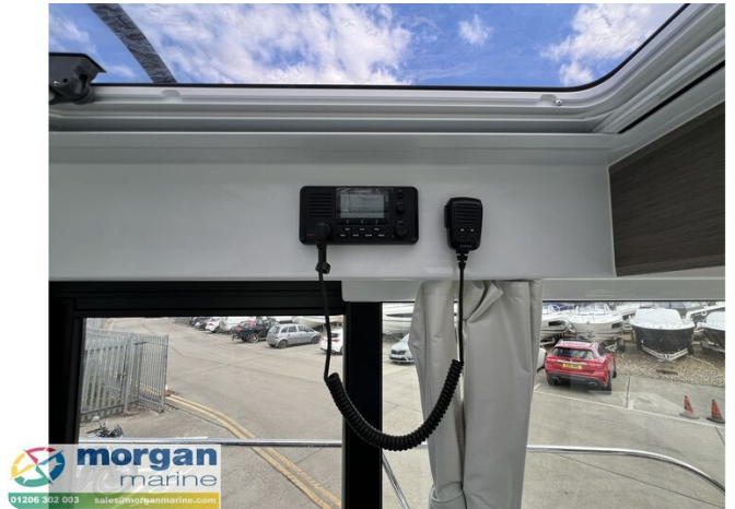
Jeanneau Merry Fisher 895 Series 2 - VHF radio