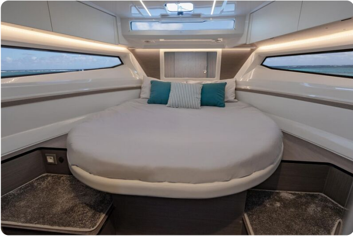
New Jeanneau Merry Fisher 895 - forward cabin