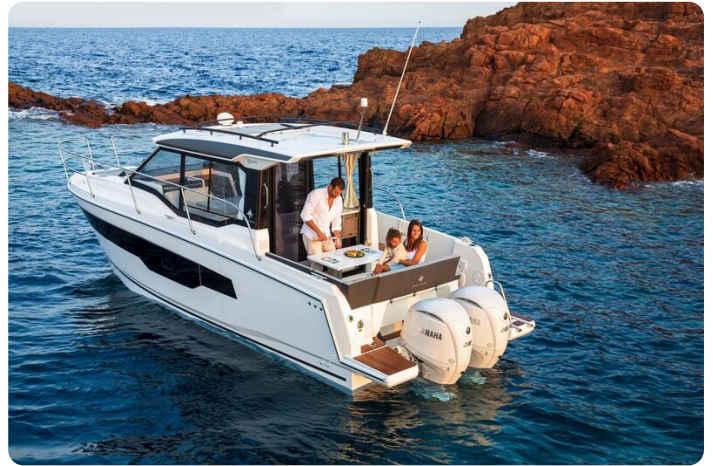
New Jeanneau Merry Fisher 895 - overhead view of transom and swim platform