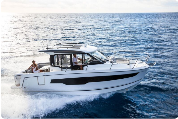
New Jeanneau Merry Fisher 895