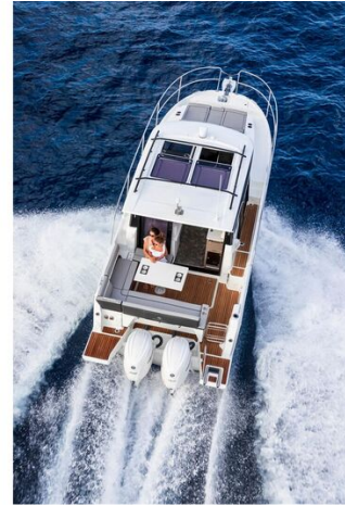
New Jeanneau Merry Fisher 895 - overhead view from aft