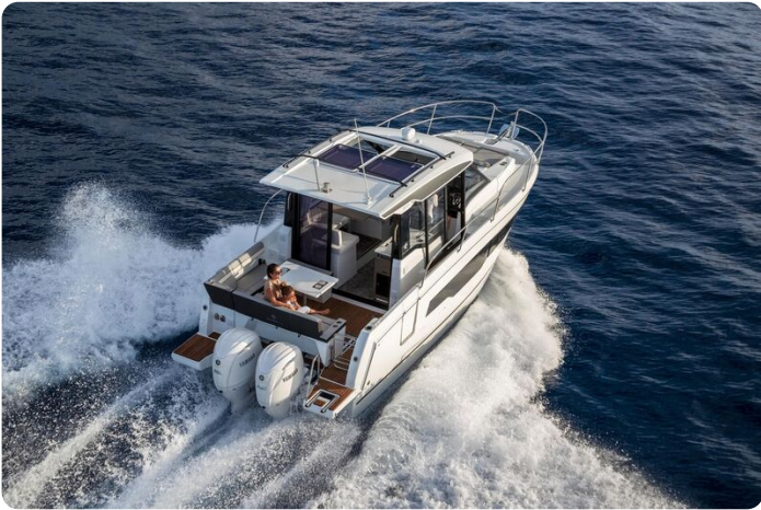
New Jeanneau Merry Fisher 895 - overhead view of cockpit seating