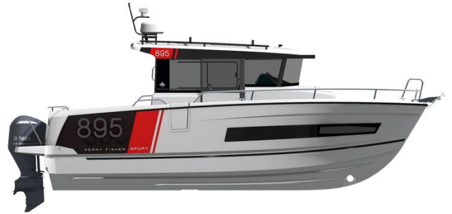
Jeanneau Merry Fisher 895 Sport - layout diagram of starboard side