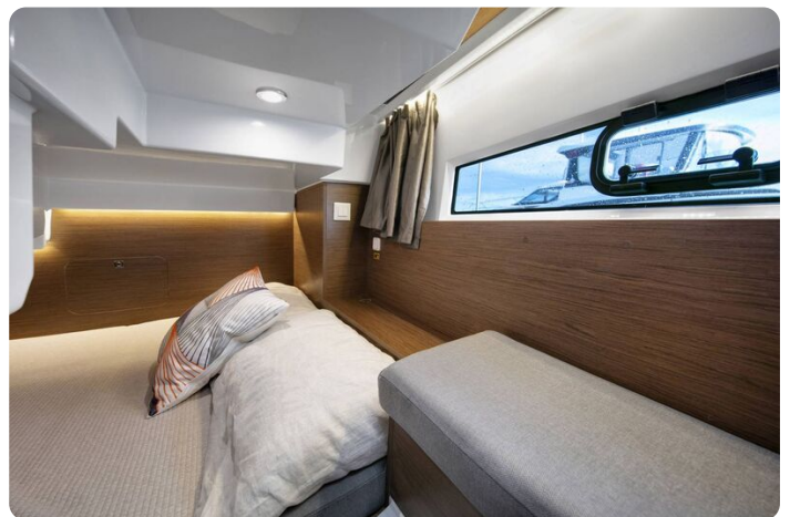
Jeanneau Merry Fisher 895 Sport - aft cabin