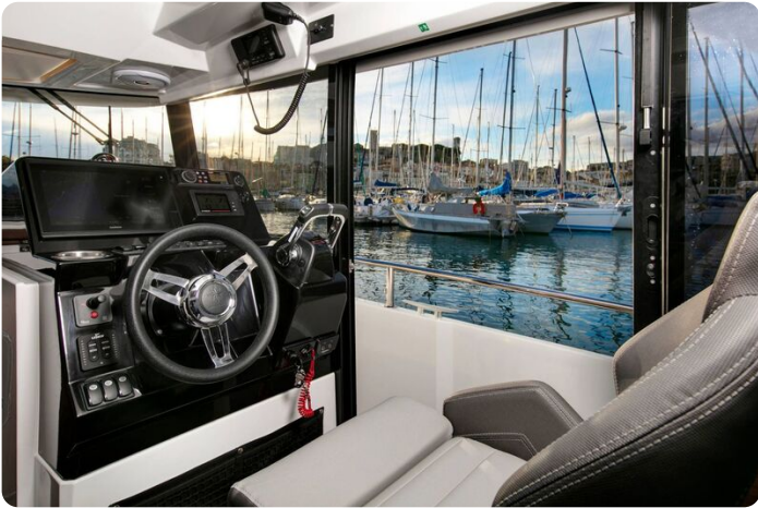
Jeanneau Merry Fisher 895 Sport - helm position and side door