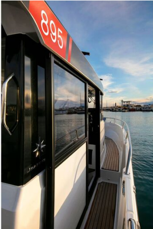
Jeanneau Merry Fisher 895 Sport - side deck towards bow