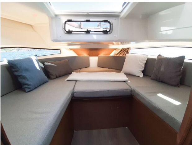
Jeanneau Merry Fisher 895 Sport - forward cabin with hatch to deck