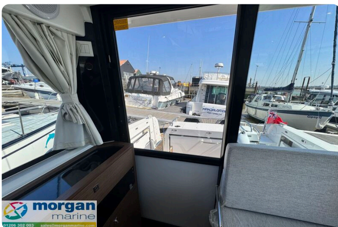
Jeanneau Merry Fisher 895 Sport Gone West - side door