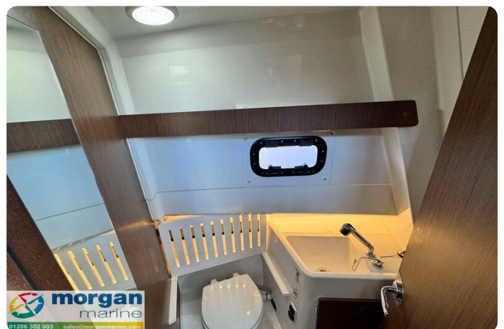
Jeanneau Merry Fisher 895 Sport Gone West - toilet