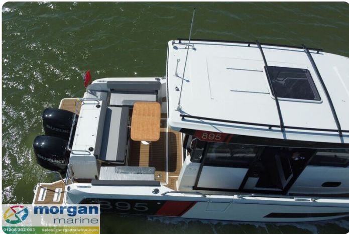
Merry Fisher 895 Sport - seating