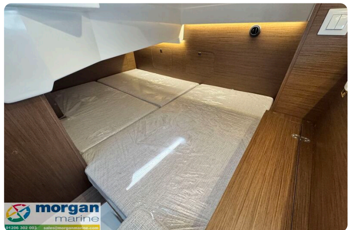
Jeanneau Merry Fisher 895 Sport Gone West - 2nd cabin