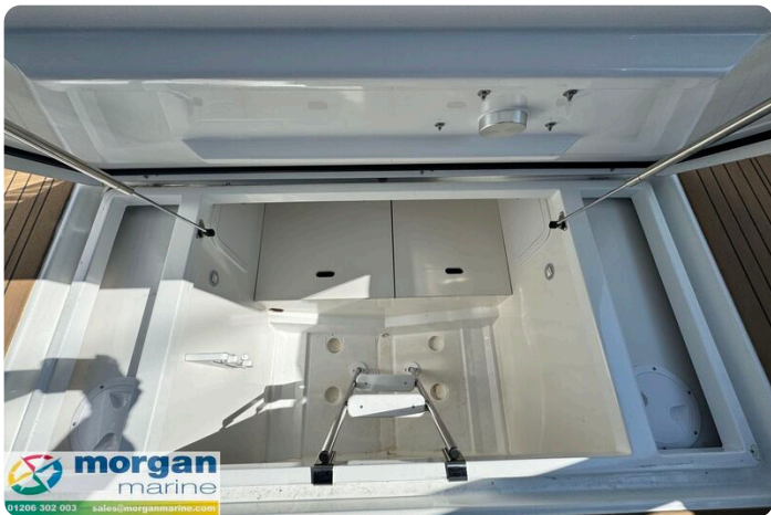
Jeanneau Merry Fisher 895 Sport Gone West - locker