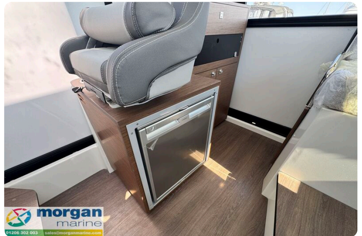
Jeanneau Merry Fisher 895 Sport Gone West - fridge