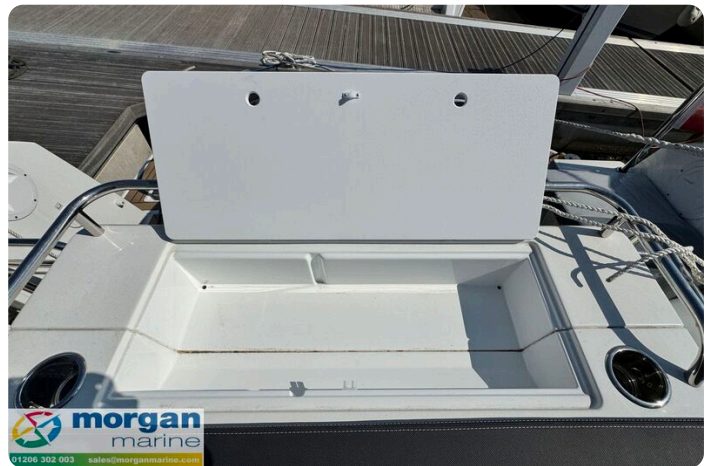
Jeanneau Merry Fisher 895 Sport Gone West - storage