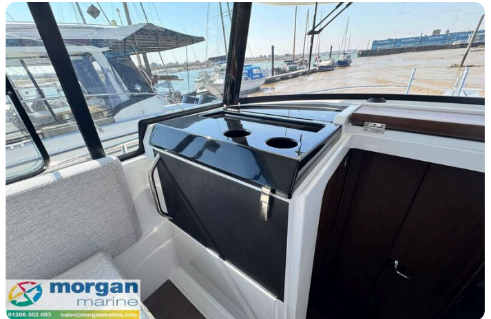
Jeanneau Merry Fisher 895 Sport Gone West - galley