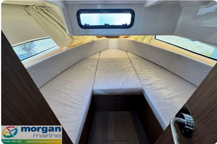
Jeanneau Merry Fisher 895 Sport Gone West - main berth