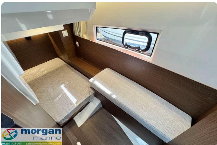
Jeanneau Merry Fisher 895 Sport Gone West - 2nd cabin seating