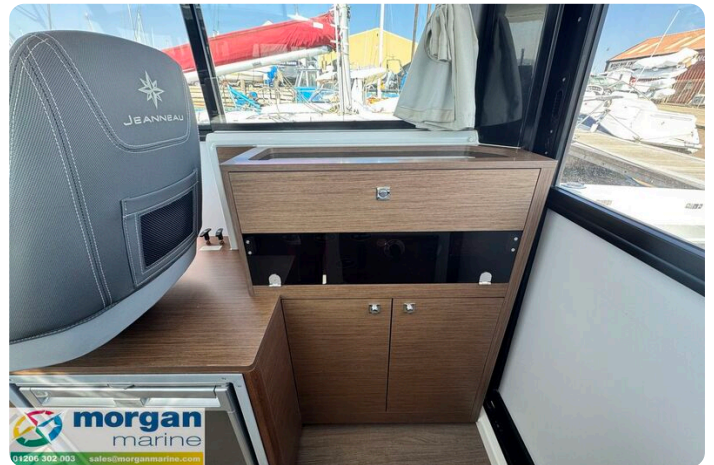
Jeanneau Merry Fisher 895 Sport Gone West - storage