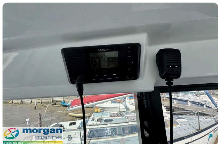
Jeanneau Merry Fisher 895 Sport Gone West - VHF radio