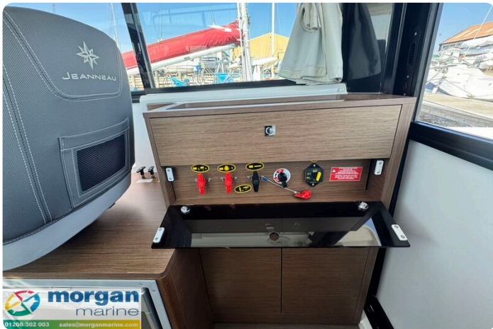
Jeanneau Merry Fisher 895 Sport Gone West - isolators