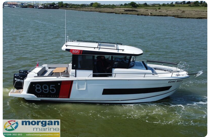
Merry Fisher 895 Sport - side on