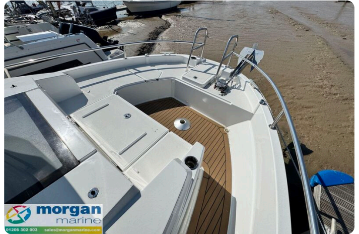
Jeanneau Merry Fisher 895 Sport Gone West - front cockpit