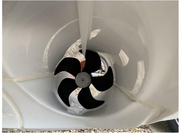
Jeanneau NC 37 twin diesel cruiser - bow thruster