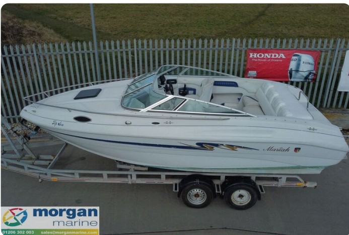
Mariah Shabah 218 - overview