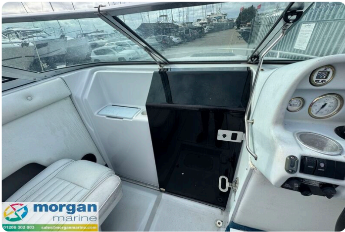
Mariah Shabah 218 - door