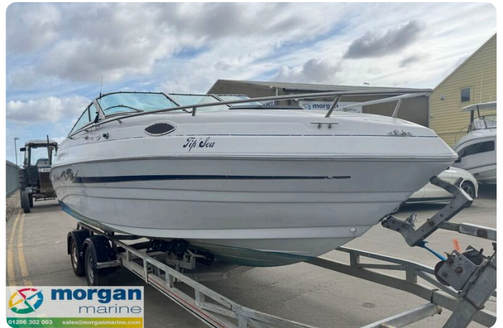
Mariah Shabah 218 - bow rails