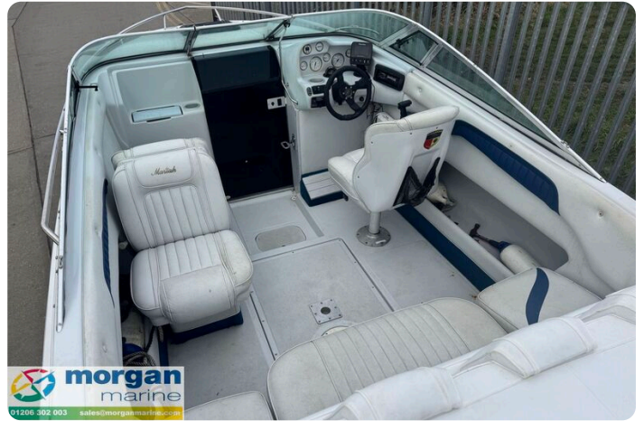
Mariah Shabah 218 - cockpit