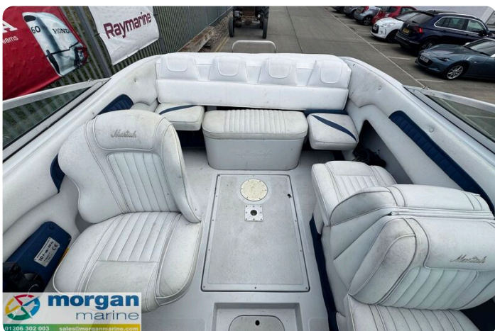
Mariah Shabah 218 - cockpit