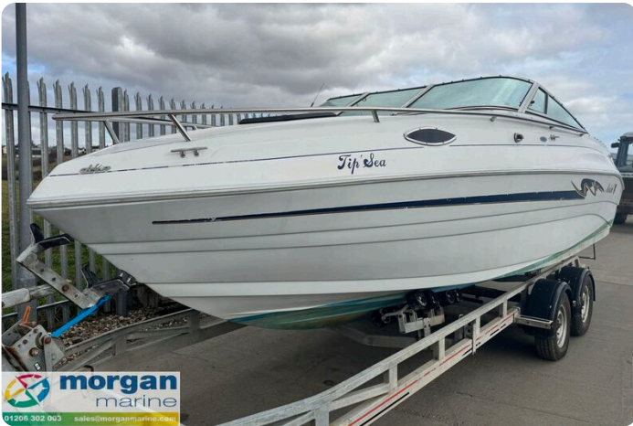
Mariah Shabah 218 - front