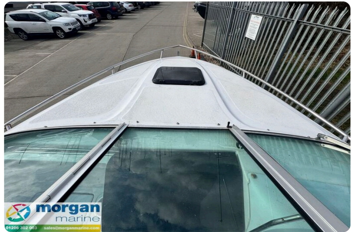
Mariah Shabah 218 - hatch