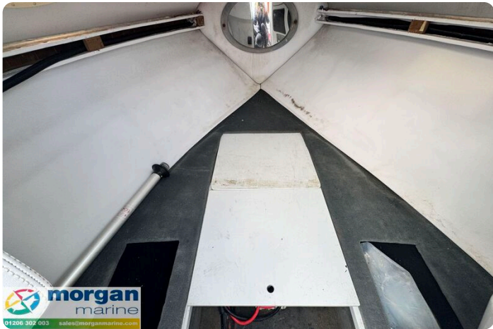
Mariah Shabah 218 - cabin