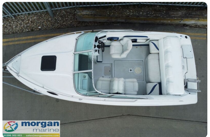
Mariah Shabah 218 - top view