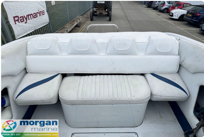
Mariah Shabah 218 - back seating