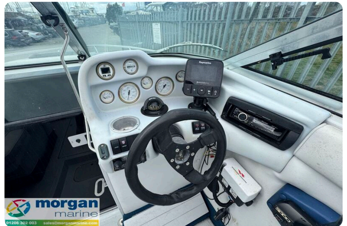
Mariah Shabah 218 - wheel