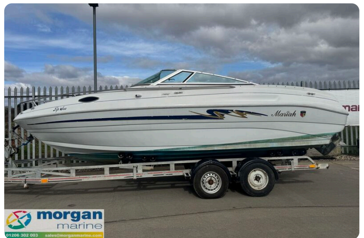
Mariah Shabah 218 - side view