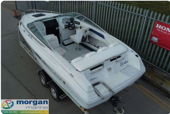
Mariah Shabah 218 - back overview