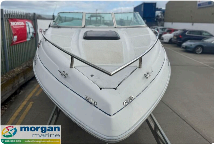
Mariah Shabah 218 - bow