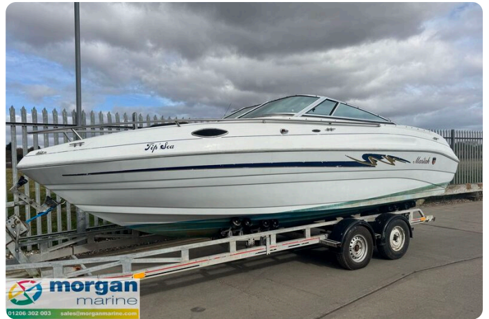
Mariah Shabah 218 - Main