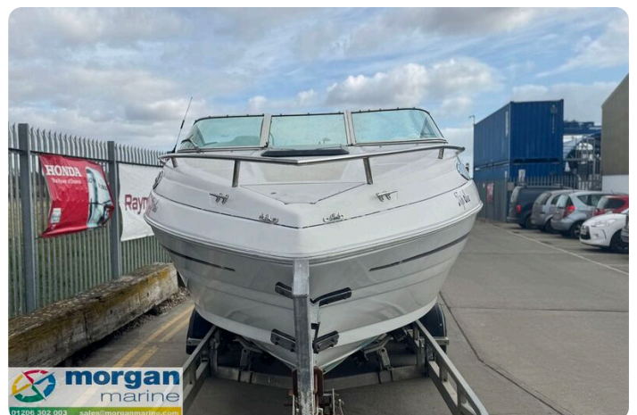
Mariah Shabah 218 - bow view