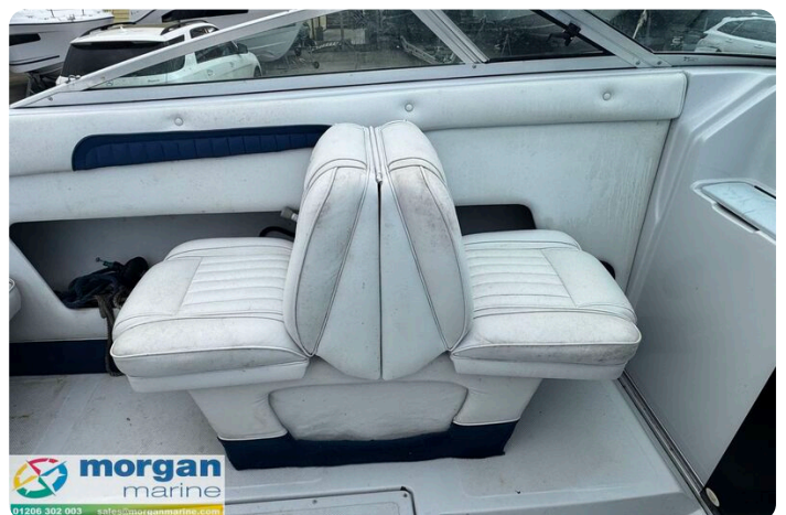
Mariah Shabah 218 - back to back seating