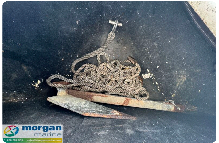
Mariah Shabah 218 - anchor