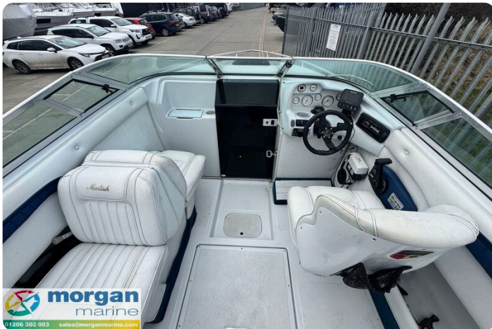
Mariah Shabah 218 - cockpit