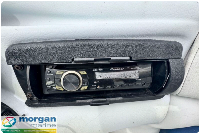
Mariah Shabah 218 - Radio