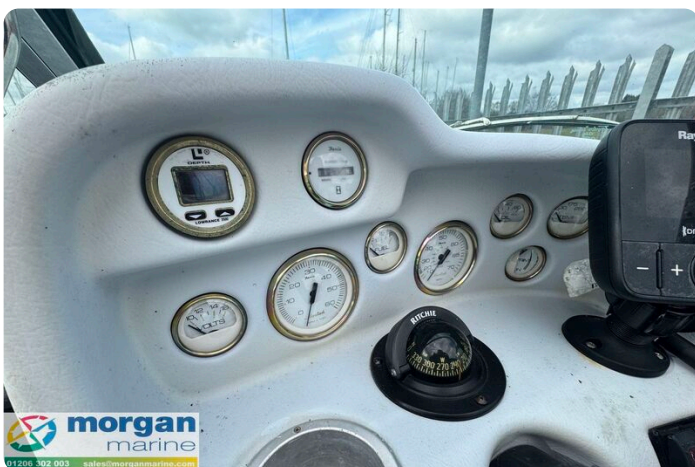
Mariah Shabah 218 - compass