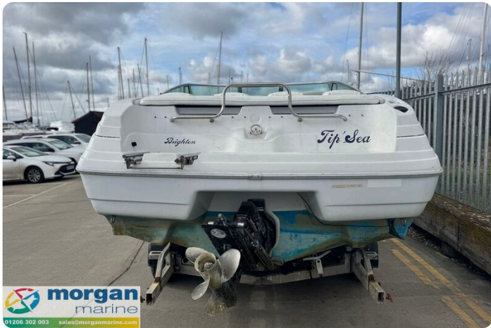
Mariah Shabah 218 - ski eye