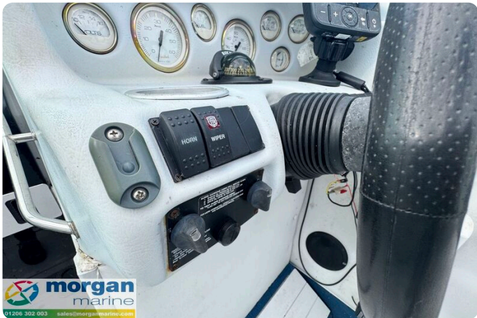
Mariah Shabah 218 - controls