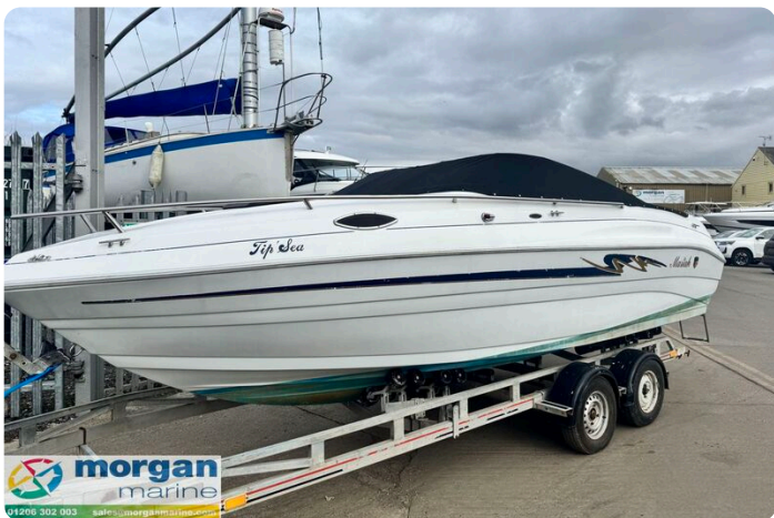
Mariah Shabah 218 - cover