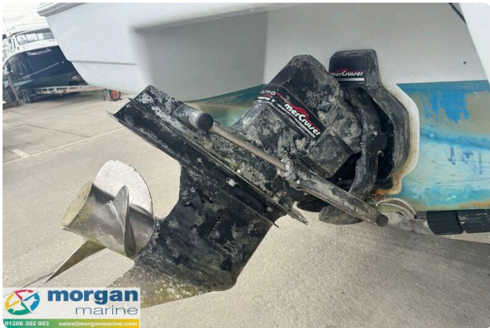
Mariah Shabah 218 - prop