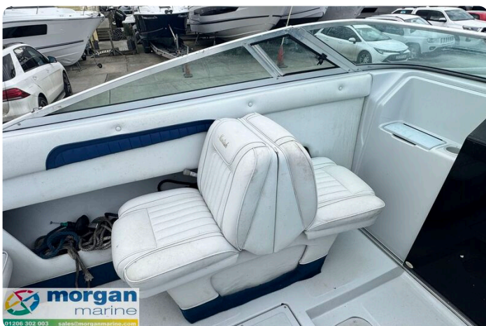
Mariah Shabah 218 - co pilot seat