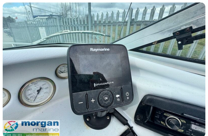
Mariah Shabah 218 - Raymarine