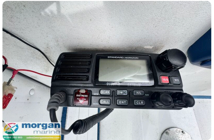
Mariah Shabah 218 - VHF radio