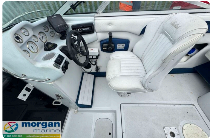
Mariah Shabah 218 - pilot seat