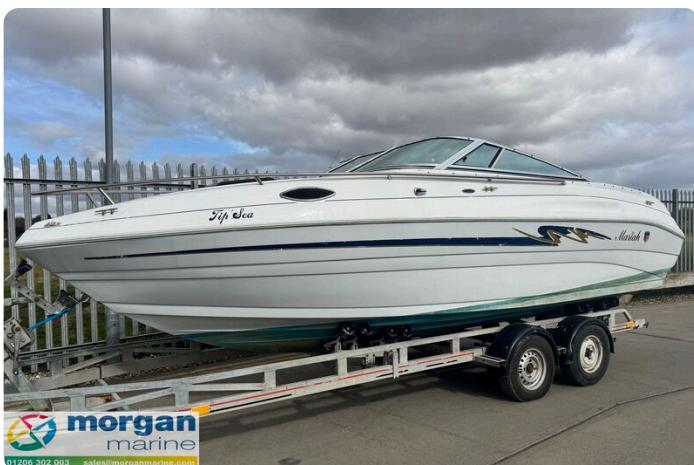
Mariah Shabah 218 - trailer