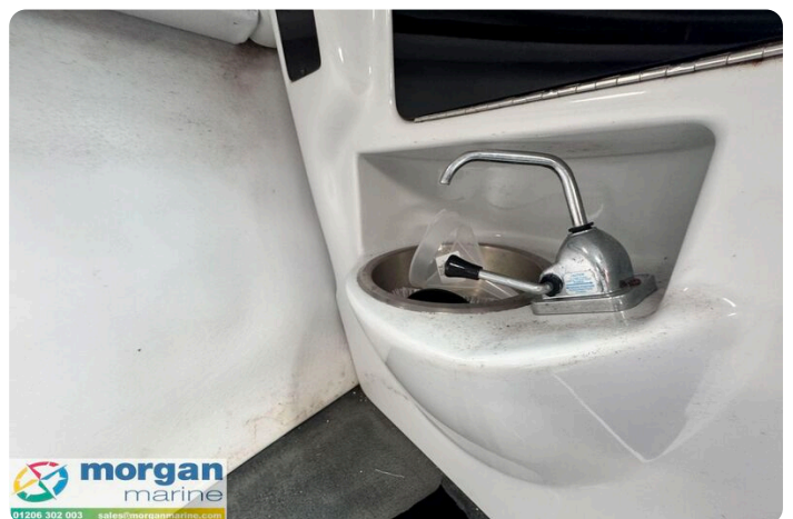
Mariah Shabah 218 - sink