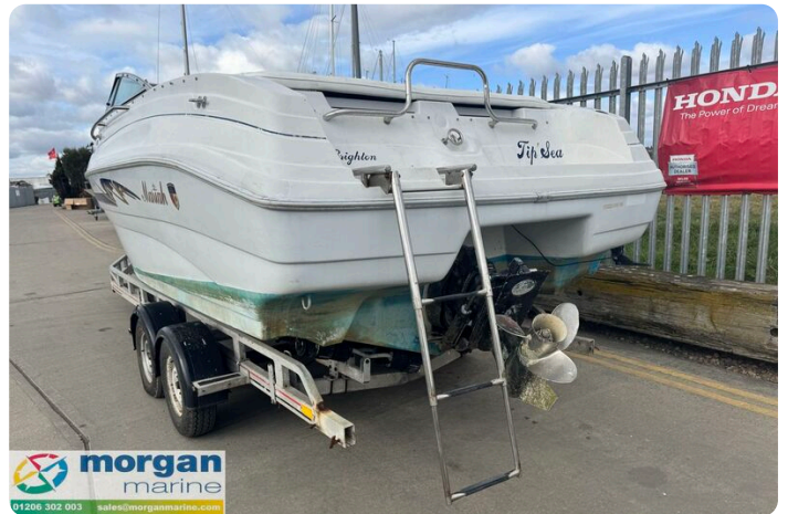
Mariah Shabah 218 - boarding ladder