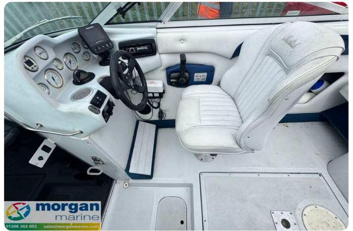
Mariah Shabah 218 - pilot seat