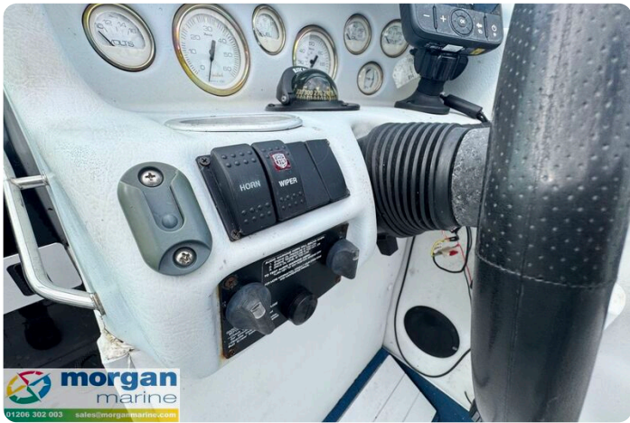
Mariah Shabah 218 - controls