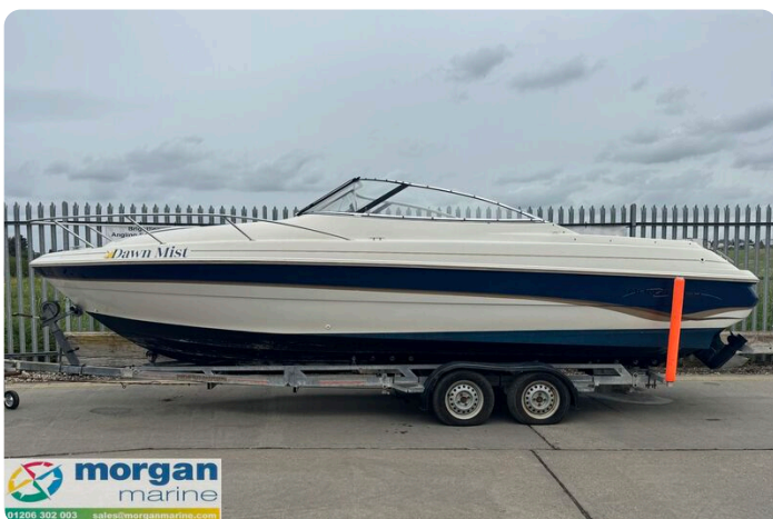
Monterey 236 - side on