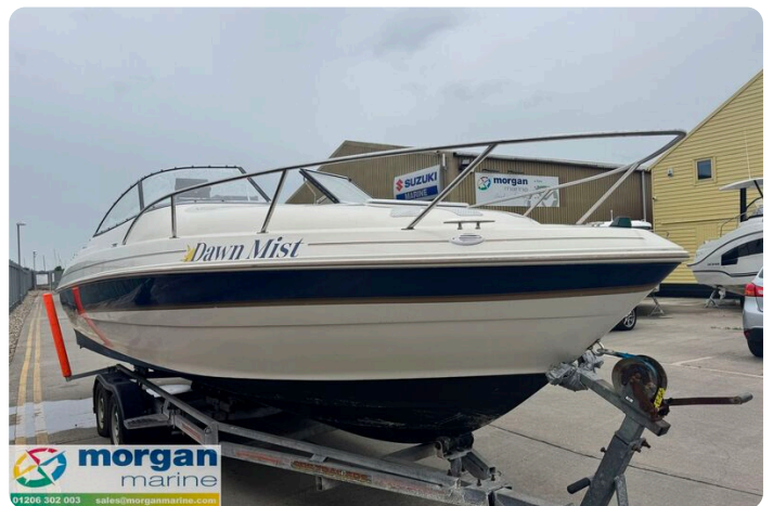
Monterey 236 - bow