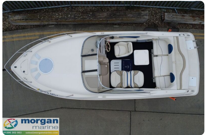
Monterey 236 - top view