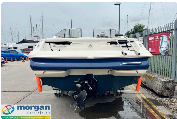
Monterey 236 - stern