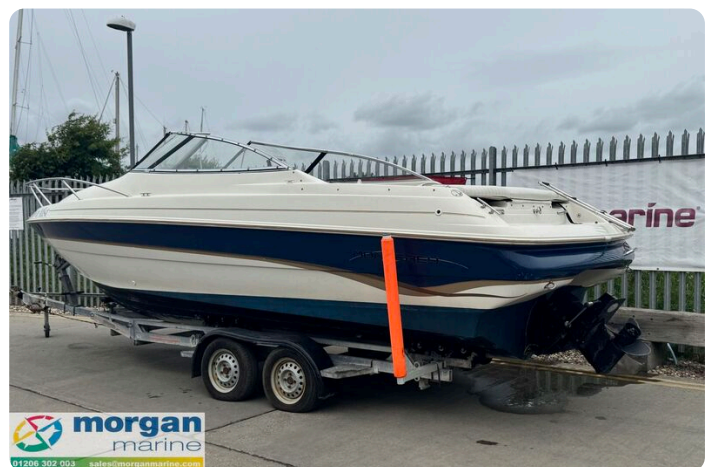
Monterey 236 - back view