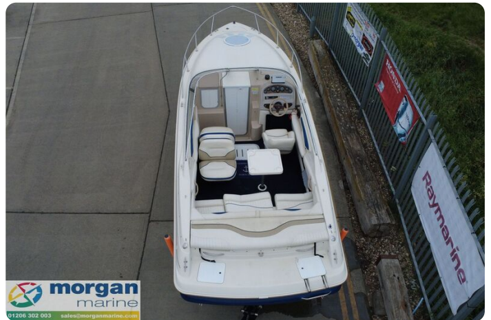
Monterey 236 - overview stern