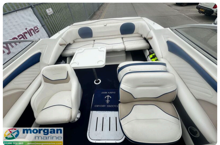
Monterey 236 - seats