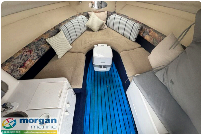
Monterey 236 - cabin