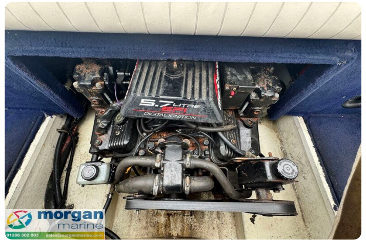
Monterey 236 - engine