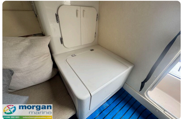
Monterey 236 - cabin storage