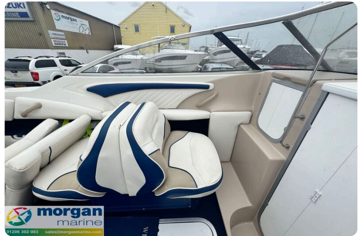
Monterey 236 - co pilot seat