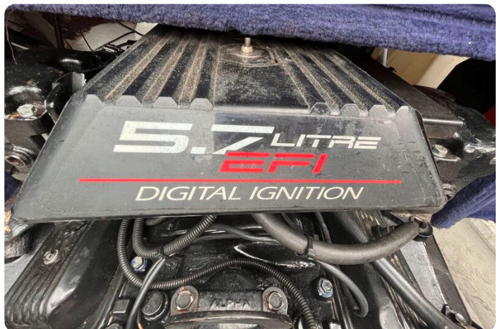
Monterey 236 - engine make