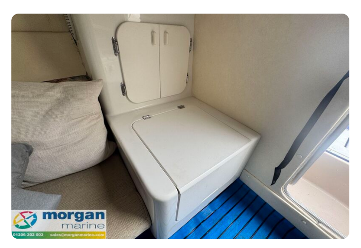
Monterey 236 - cabin storage