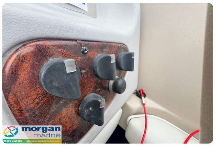
Monterey 236 - buttons