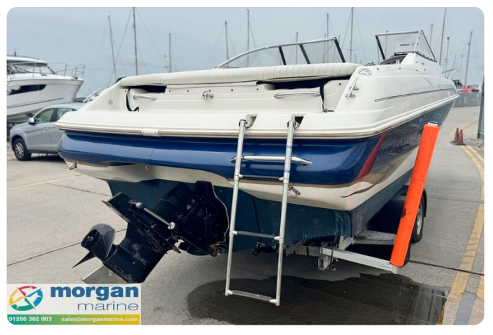
Monterey 236 - ladder