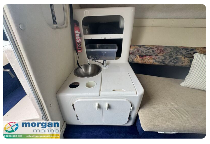
Monterey 236 - sink