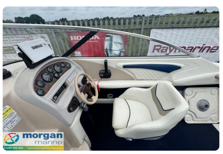
Monterey 236 - pilot seat