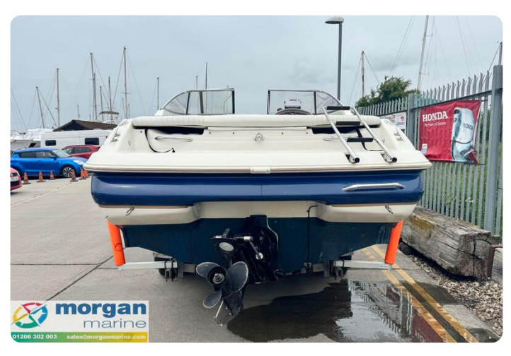
Monterey 236 - stern