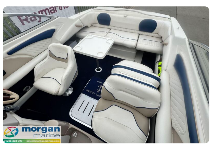
Monterey 236 - table