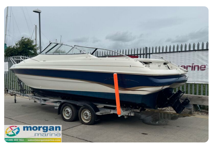
Monterey 236 - back view