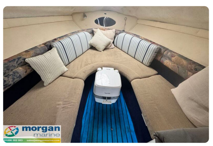
Monterey 236 - toilet