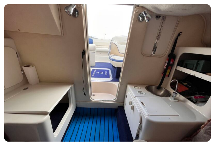
Monterey 236 - door