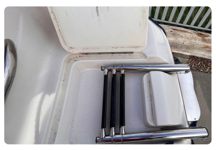
Monterey 236 - ladder folded up