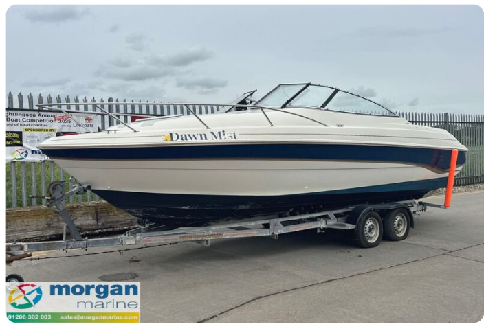
Monterey 236 - Main