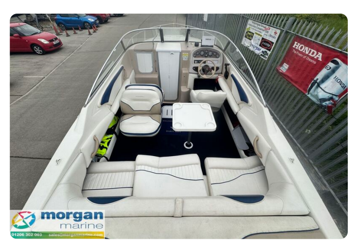
Monterey 236 - cockpit