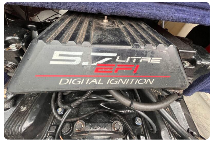
Monterey 236 - engine make