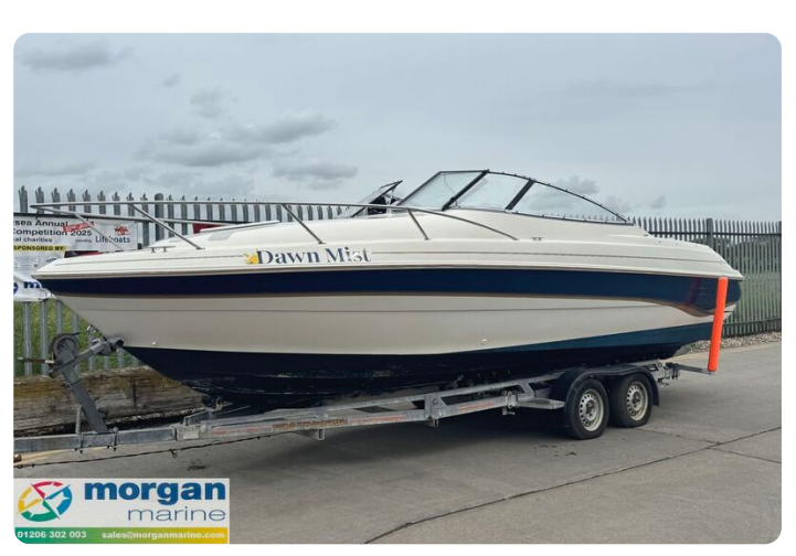
Monterey 236 - side