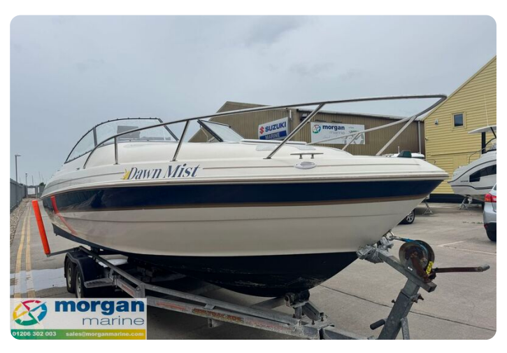
Monterey 236 - bow