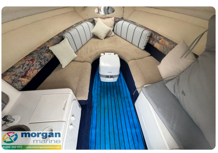
Monterey 236 - cabin