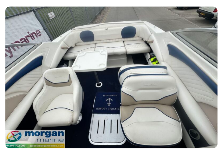
Monterey 236 - seats