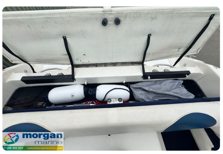
Monterey 236 - fenders