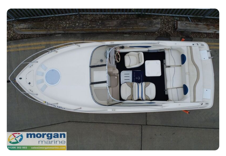
Monterey 236 - top view