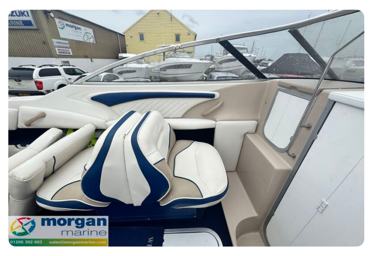
Monterey 236 - co pilot seat