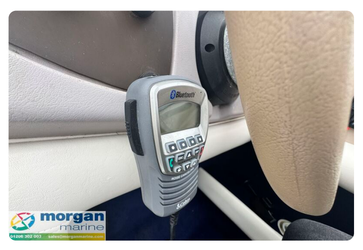
Monterey 236 - VHF