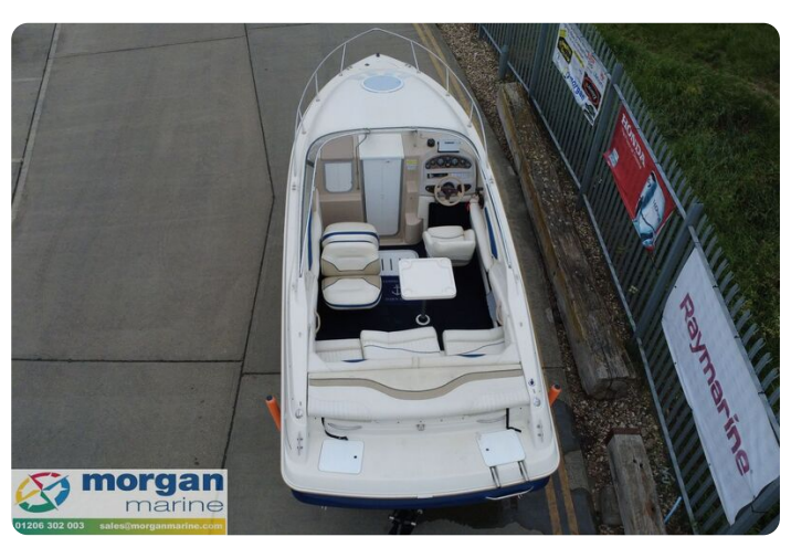
Monterey 236 - overview stern