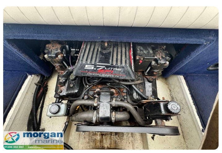
Monterey 236 - engine