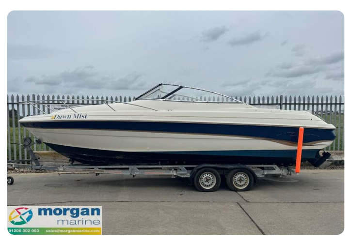
Monterey 236 - side on