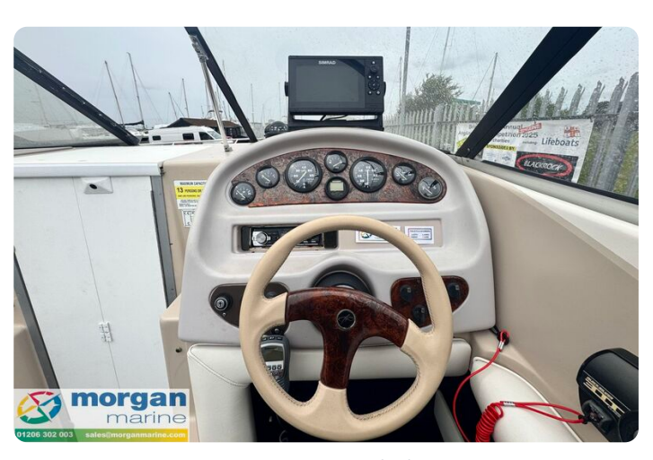
Monterey 236 - wheel