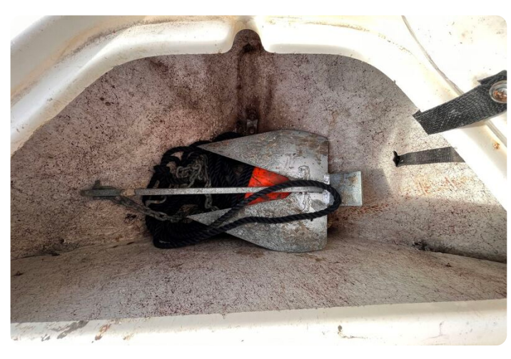
Monterey 236 - anchor