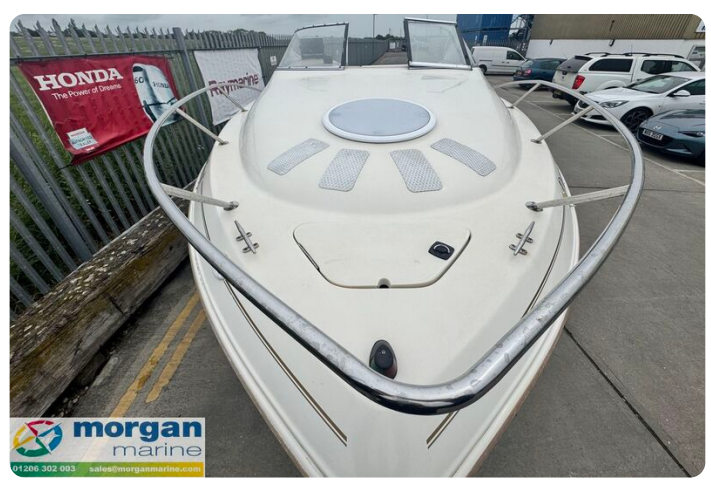
Monterey 236 - bow view