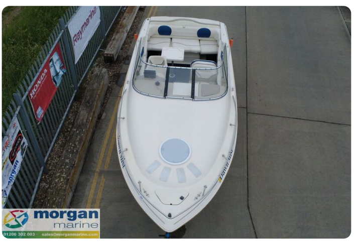
Monterey 236 - overview