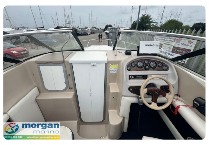
Monterey 236 - walk through