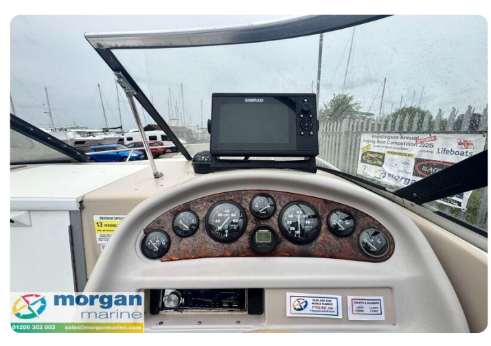
Monterey 236 - dash