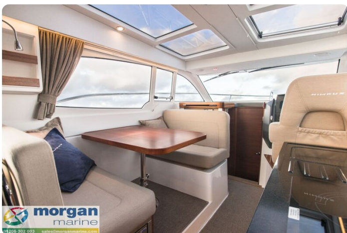
Nimbus 305 Coupe Interior 1