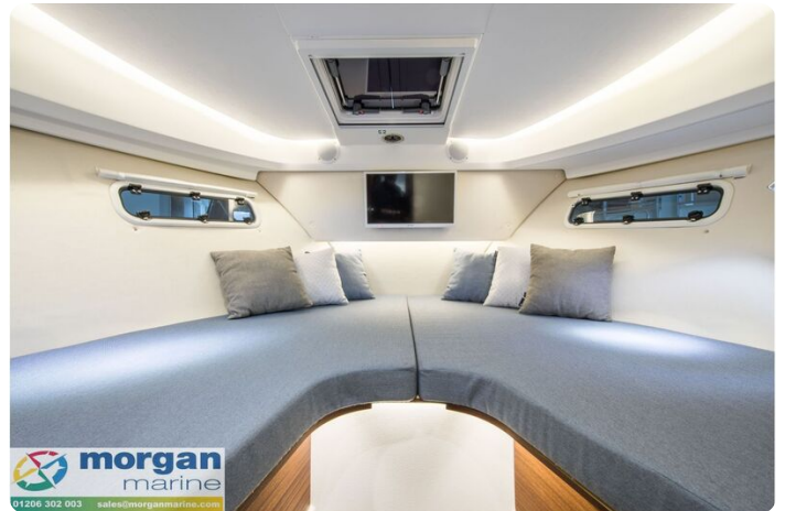
Nimbus 305 Coupe Cabin 1