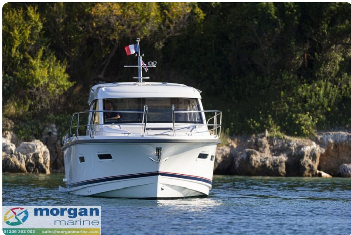
Nimbus 305 Coupe Exterior 17