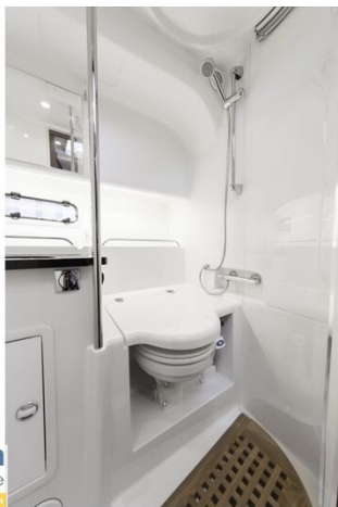
Nimbus 305 Coupe Head 1