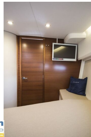
Nimbus 305 Coupe Cabin 5