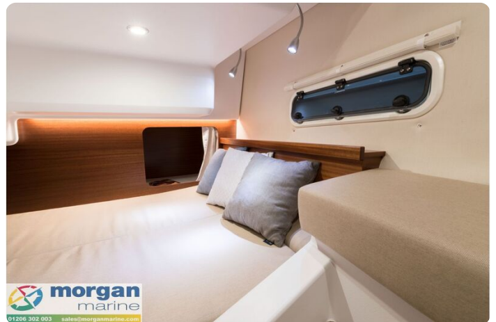
Nimbus 305 Coupe Cabin 4