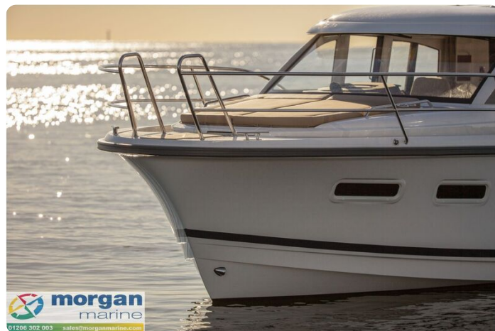
Nimbus 305 Coupe Exterior 7