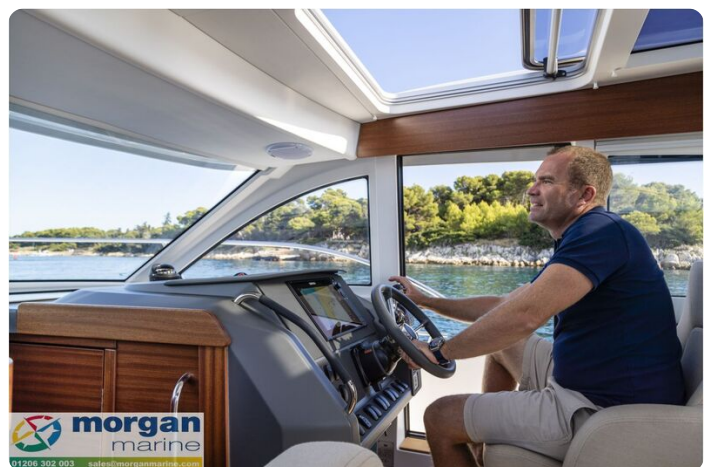
Nimbus 305 Coupe Interior 2