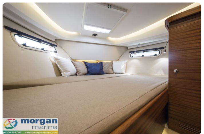
Nimbus 305 Coupe Cabin 3