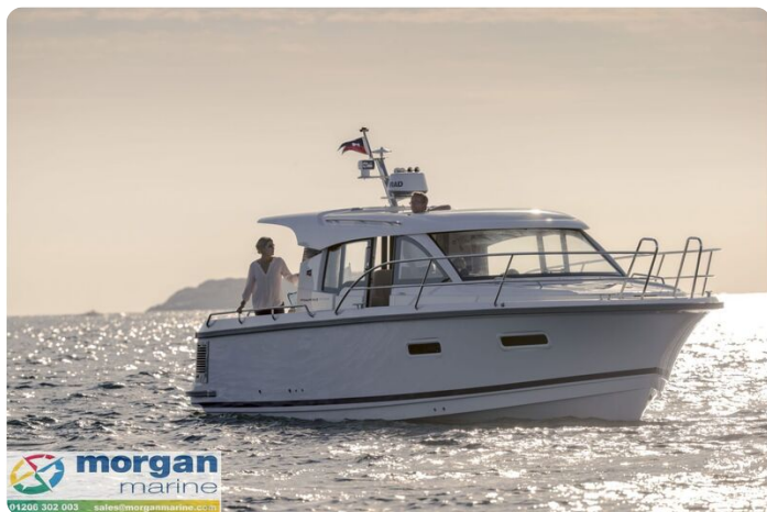
Nimbus 305 Coupe Exterior 1