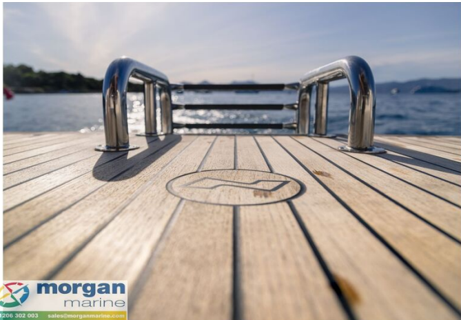
Nimbus 305 Coupe Exterior 21