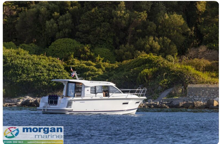
Nimbus 305 Coupe Exterior 16