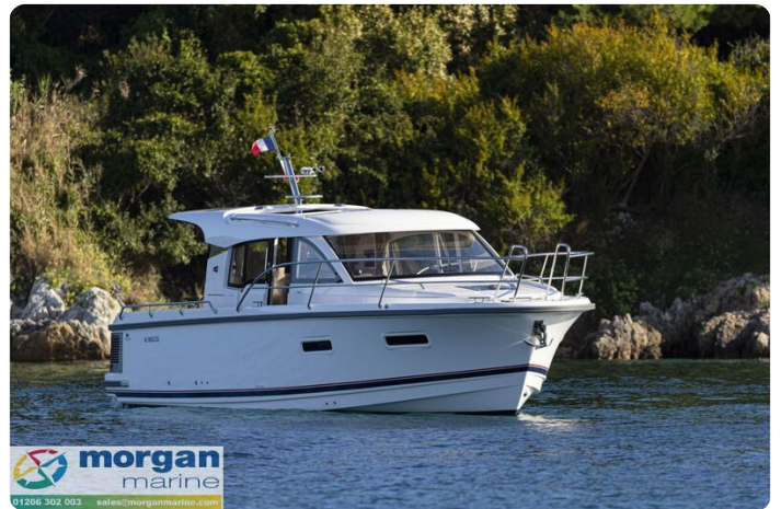
Nimbus 305 Coupe Exterior 18