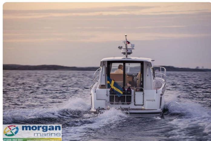
Nimbus 305 Coupe Exterior 4