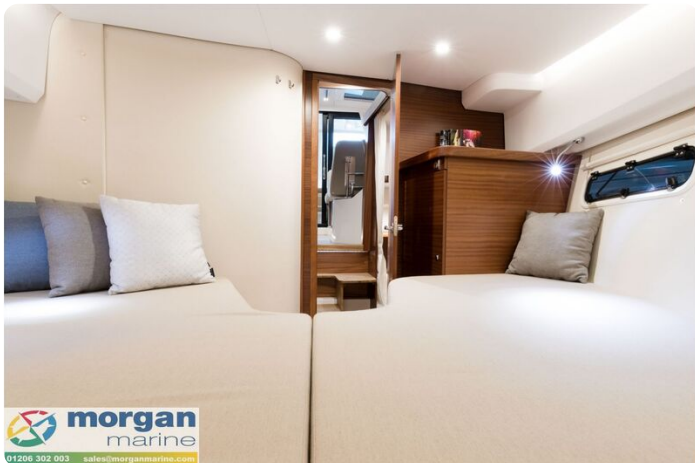
Nimbus 305 Coupe Cabin 2