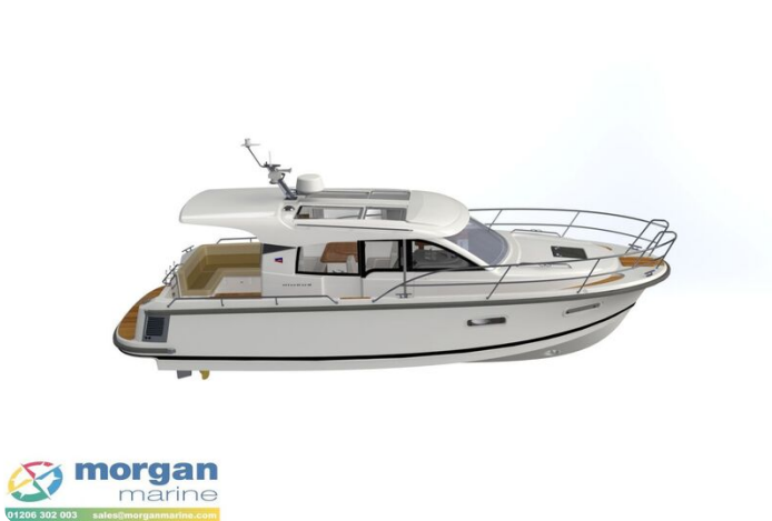
Nimbus 305 Coupe Side