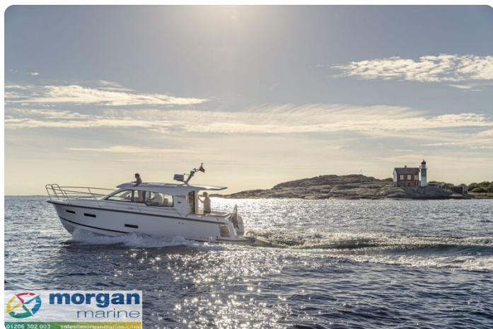
Nimbus 305 Coupe Exterior 2