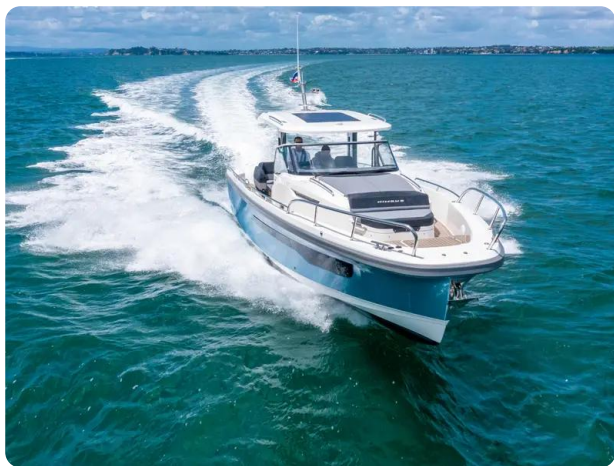
Nimbus Tender 11 (T11) Exterior 6