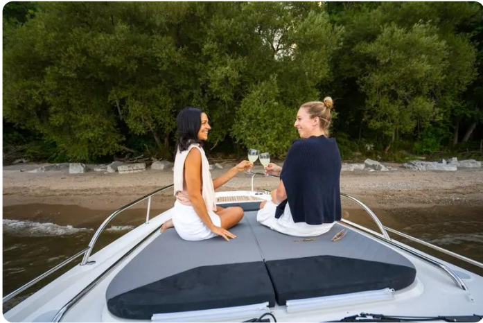
Nimbus Tender 11 (T11) Deck 8