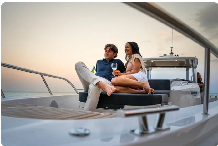
Nimbus Tender 11 (T11) Deck 6