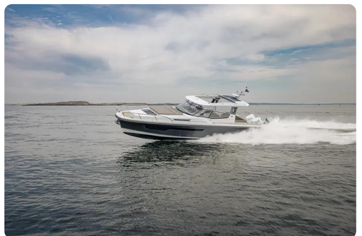
Nimbus Weekender 11 (T11) Exterior 8