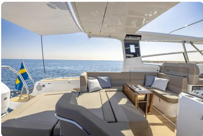
Nimbus Weekender 11 (T11) Deck 3