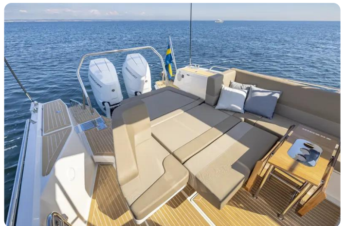
Nimbus Weekender 11 (T11) Deck 2