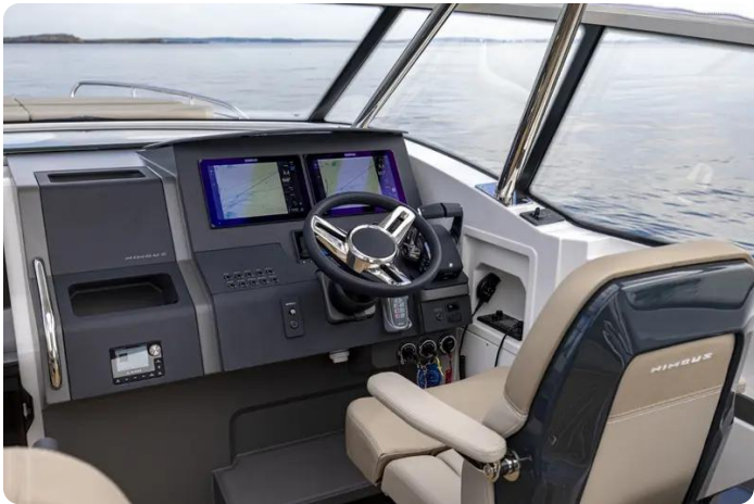
Nimbus Weekender 11 (T11) Dash 1