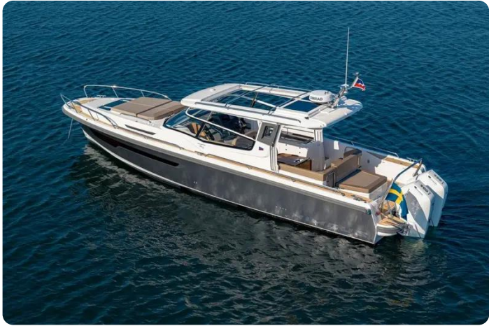
Nimbus Weekender 11 Featured