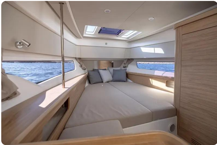
Nimbus Weekender 11 (T11) Interior 5