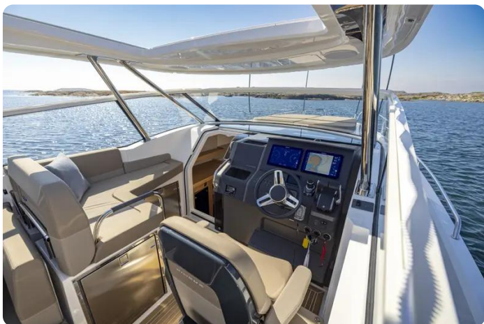
Nimbus Weekender 11 (T11) Dash 2