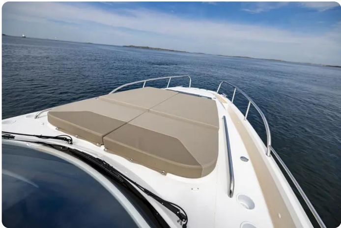
Nimbus Weekender 11 (T11) Deck 1