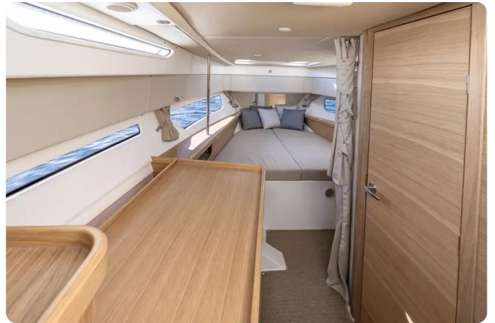
Nimbus Weekender 11 (T11) Interior 4