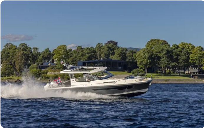
Nimbus Weekender 11 (T11) Exterior 9