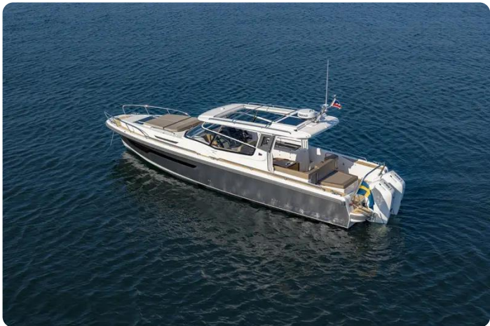
Nimbus Weekender 11 (T11) Exterior 1