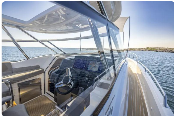
Nimbus Weekender 11 (T11) Dash 3