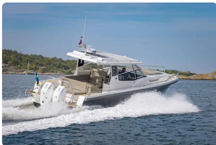
Nimbus Weekender 11 (T11) Exterior 11