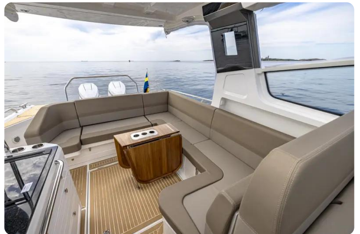
Nimbus Weekender 11 (T11) Deck 5