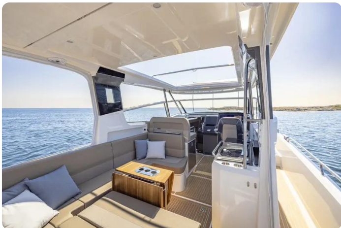
Nimbus Weekender 11 (T11) Interior 2