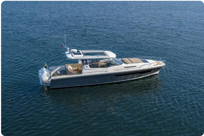
Nimbus Weekender 11 (T11) Exterior 3