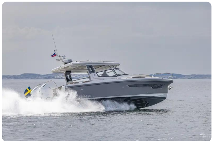
Nimbus Weekender 11 (T11) Exterior 5