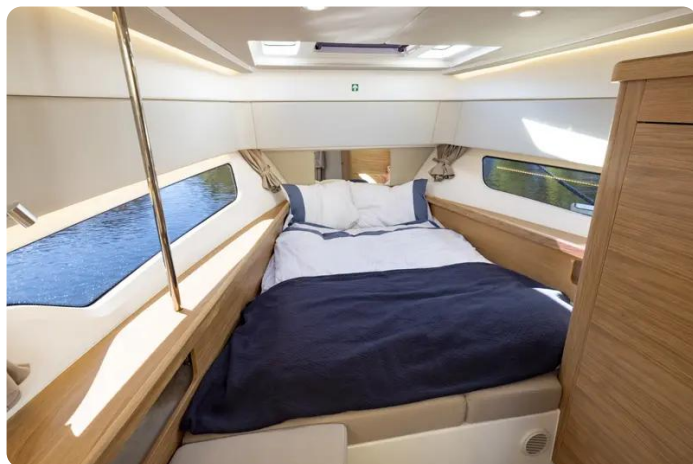
Nimbus Weekender 11 (T11) Interior 1