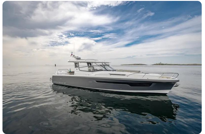
Nimbus Weekender 11 (T11) Exterior 7