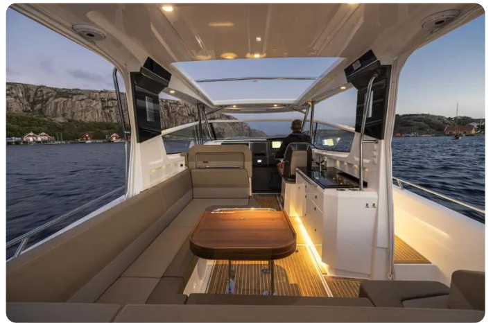
Nimbus Weekender 11 (T11) Interior 3