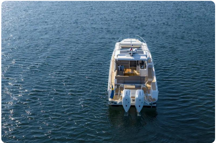
Nimbus Weekender 11 (T11) Exterior 4