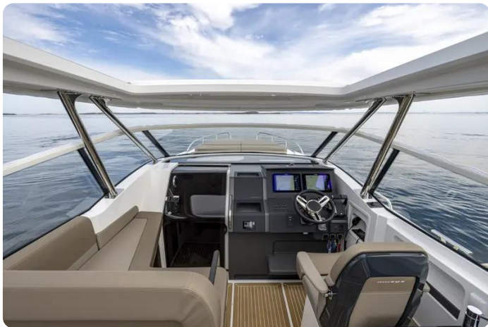
Nimbus Weekender 11 (T11) Dash 4