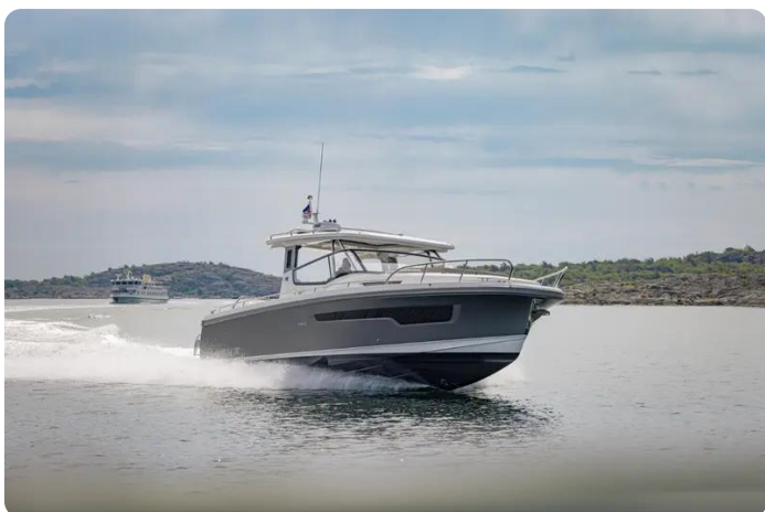
Nimbus Weekender 11 (T11) Exterior 10