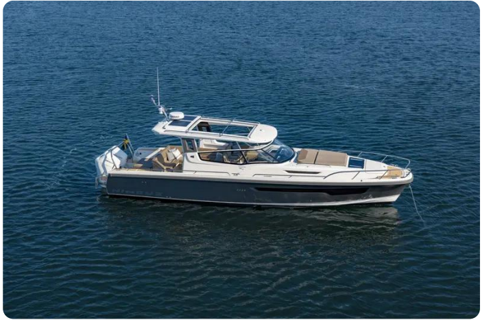
Nimbus Weekender 11 (T11) Exterior 2