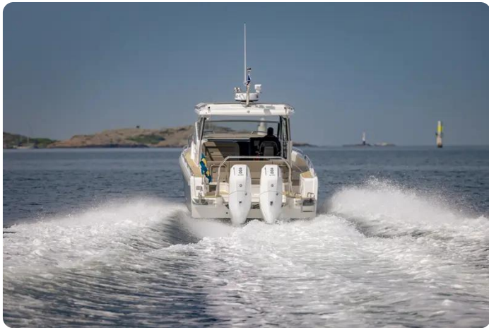
Nimbus Weekender 11 (T11) Exterior 6