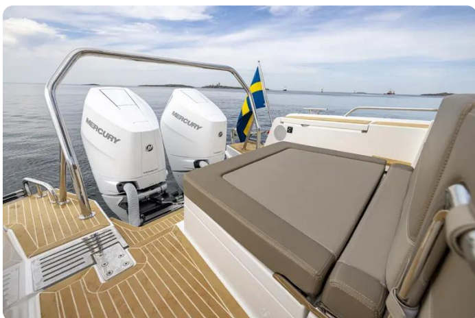
Nimbus Weekender 11 (T11) Deck 4