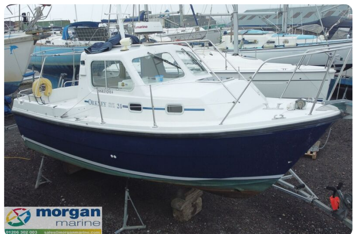
Orkney Day Angler 24 - railings