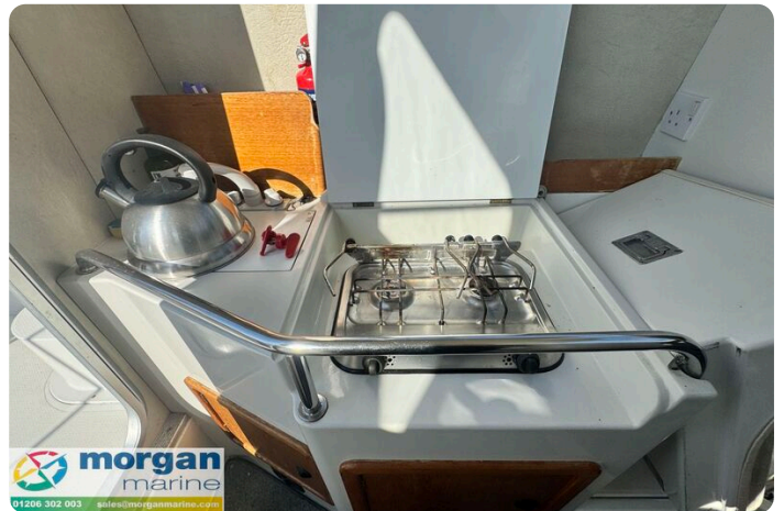
Orkney Day Angler 24 - gas stove