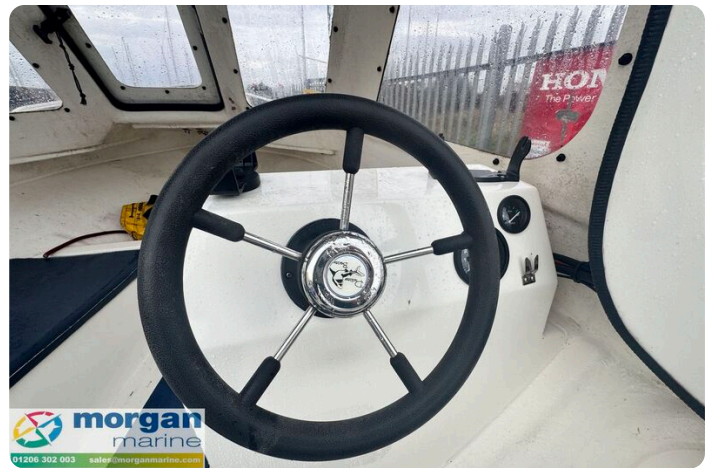
Predator 165 sea angler - wheel 2