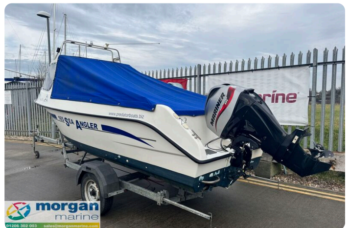
Predator 165 sea angler - mariner engine