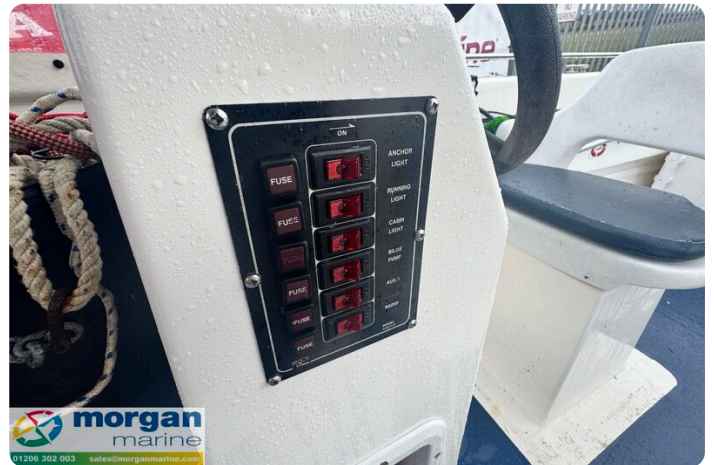
Predator 165 sea angler - Switch panel