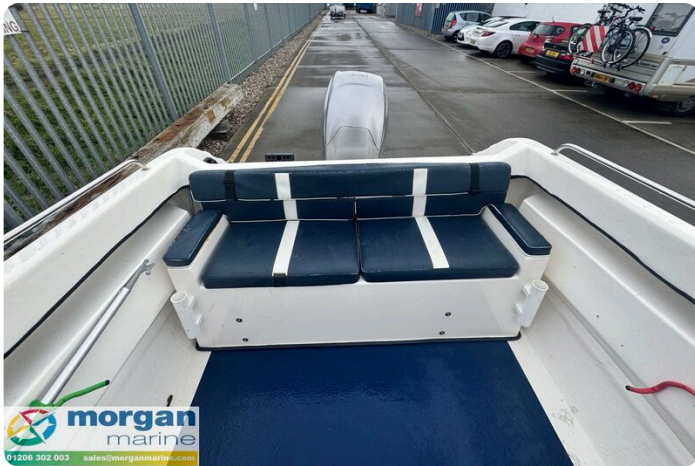
Predator 165 sea angler - bench seat