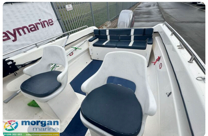
Predator 165 sea angler - co pilot