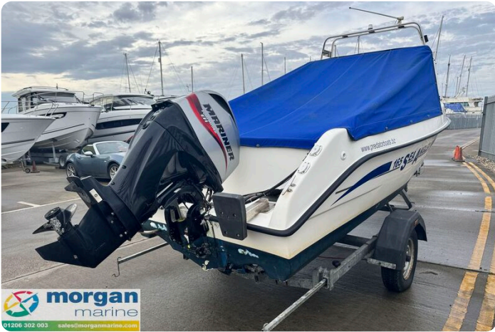
Predator 165 sea angler - aux bracket