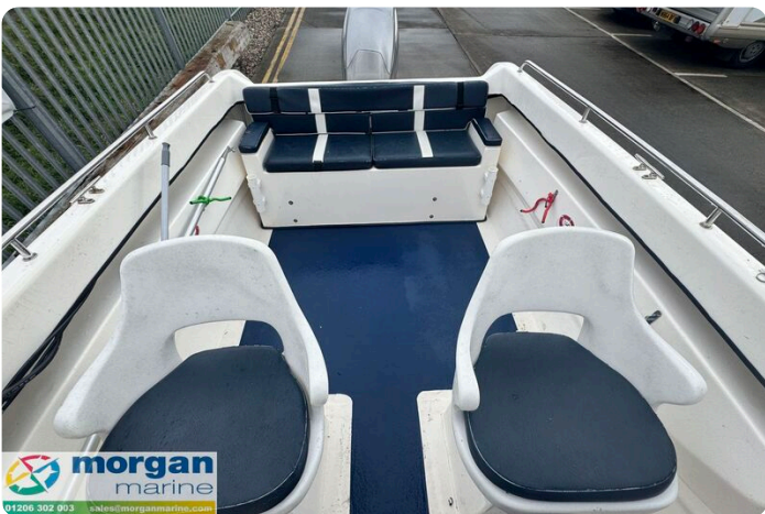
Predator 165 sea angler - chair pilot