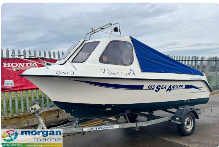
Predator 165 sea angler - main