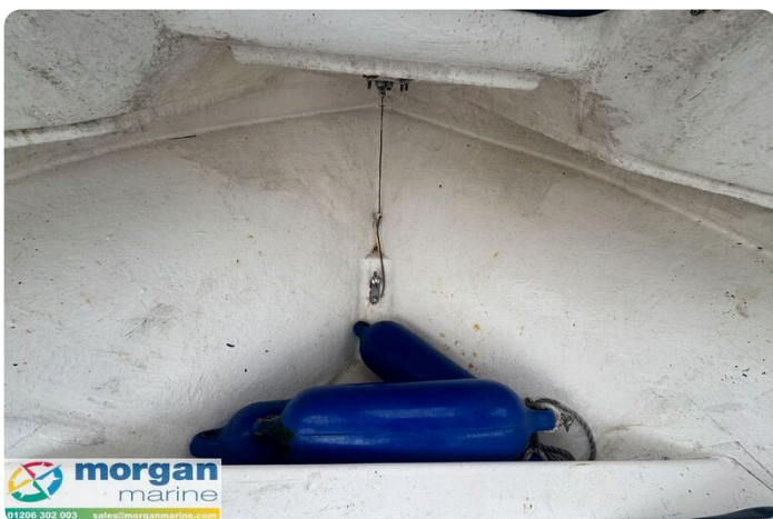
Predator 165 sea angler - fenders