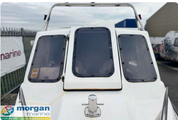
Predator 165 sea angler - bow window