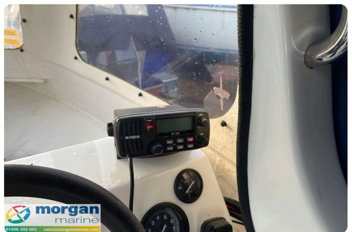
Predator 165 sea angler - VHF radio