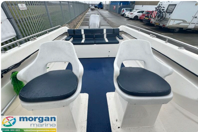
Predator 165 sea angler - pilot