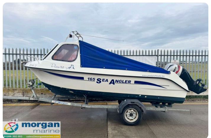
Predator 165 sea angler - Side