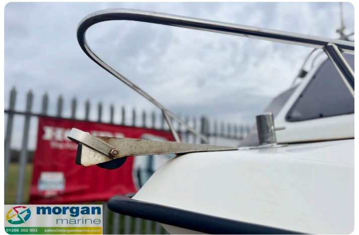
Predator 165 sea angler - bow roller