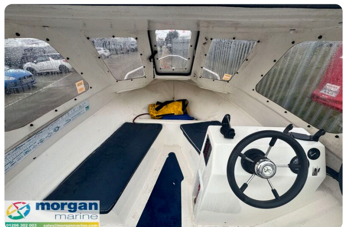
Predator 165 sea angler - wheelhouse