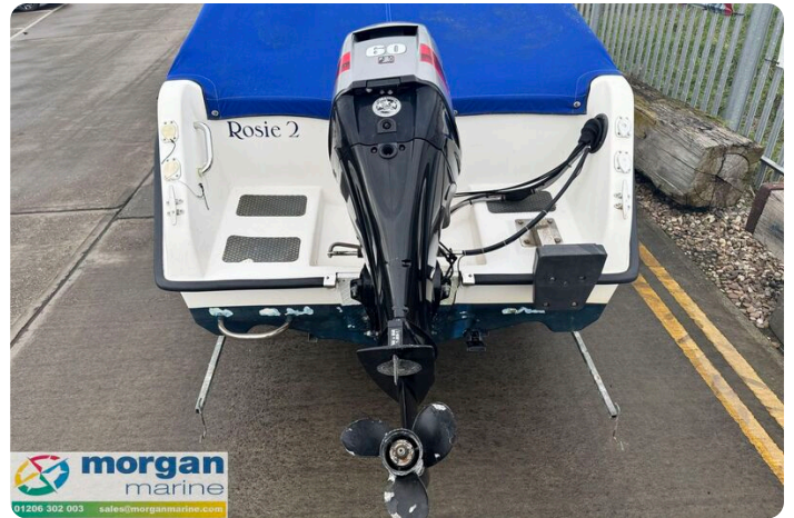
Predator 165 sea angler - engine