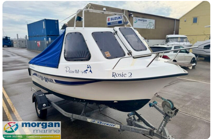
Predator 165 sea angler - front windscreen