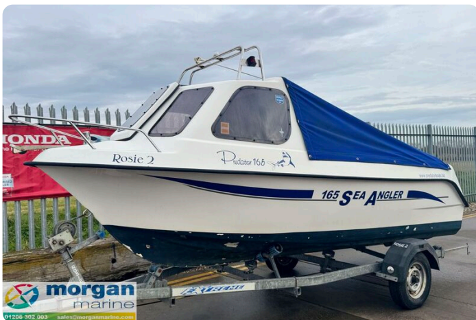
Predator 165 sea angler - main picture