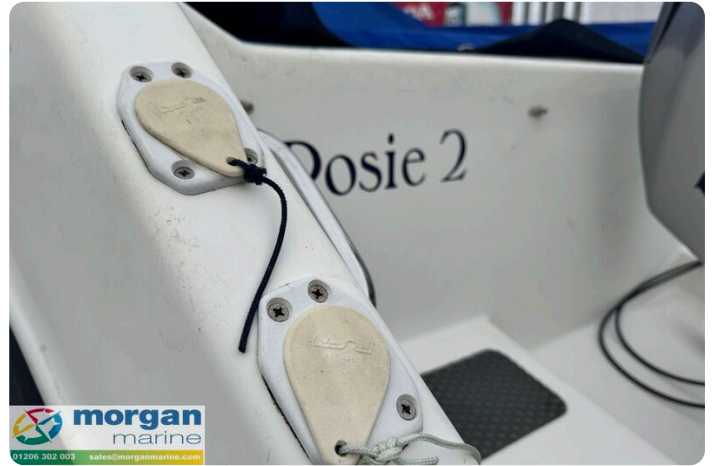
Predator 165 sea angler - rod holders