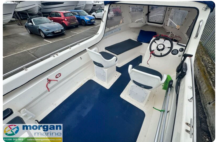
Predator 165 sea angler - cockpit deck