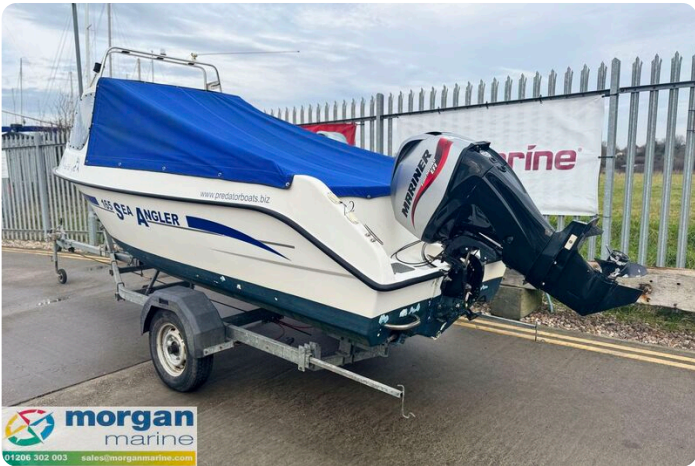
Predator 165 sea angler - back