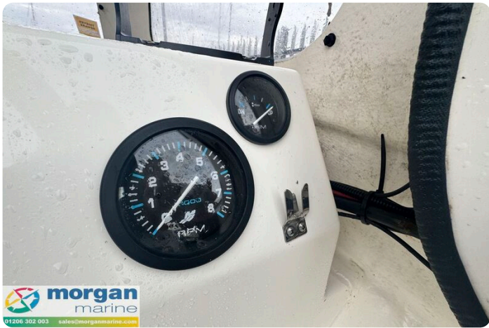
Predator 165 sea angler - gauges