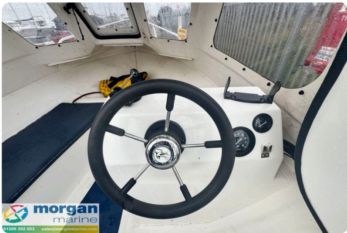
Predator 165 sea angler - wheel