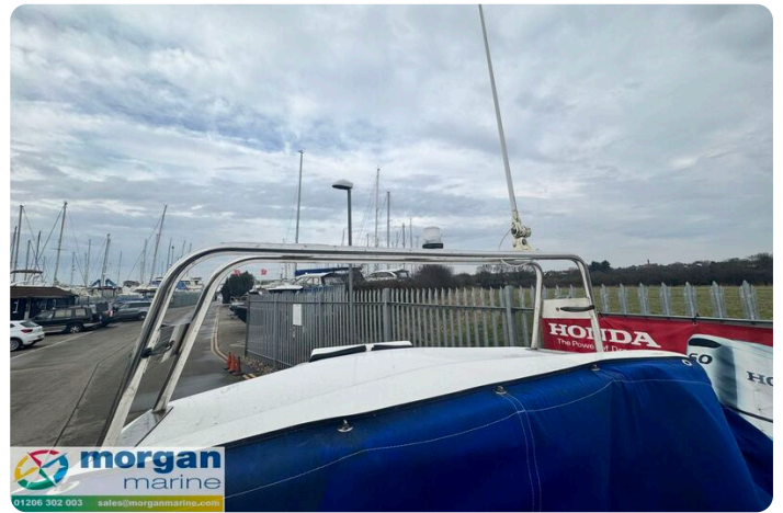
Predator 165 sea angler - arch