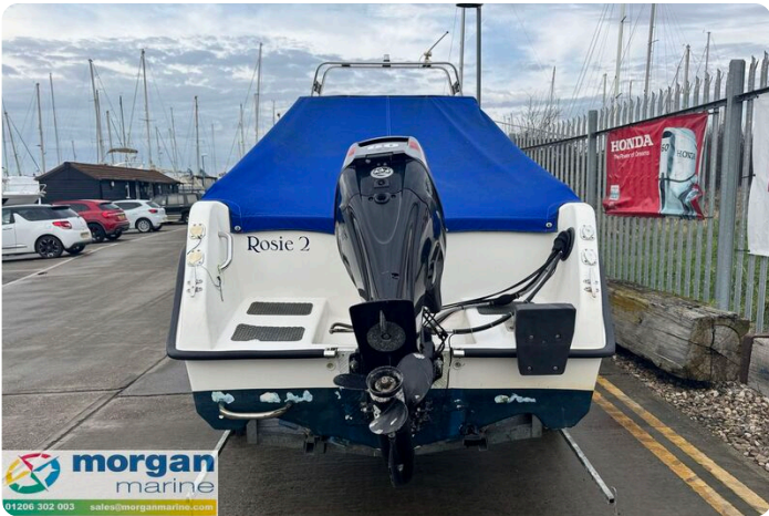
Predator 165 sea angler - prop