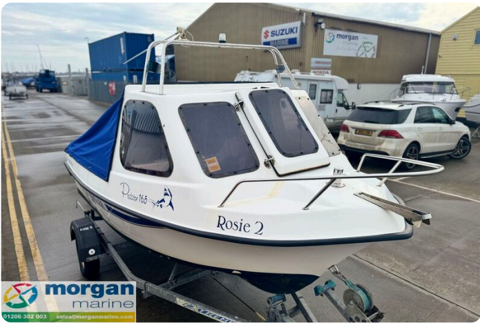
Predator 165 sea angler - bow rails