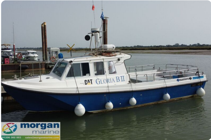
Procharter 36 GRP charter fishing boat - plenty of fenders