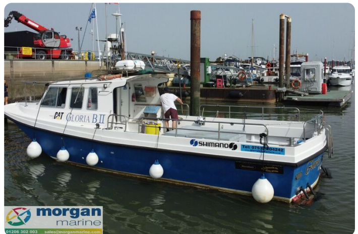
Procharter 36 GRP charter fishing boat - in the cockpit