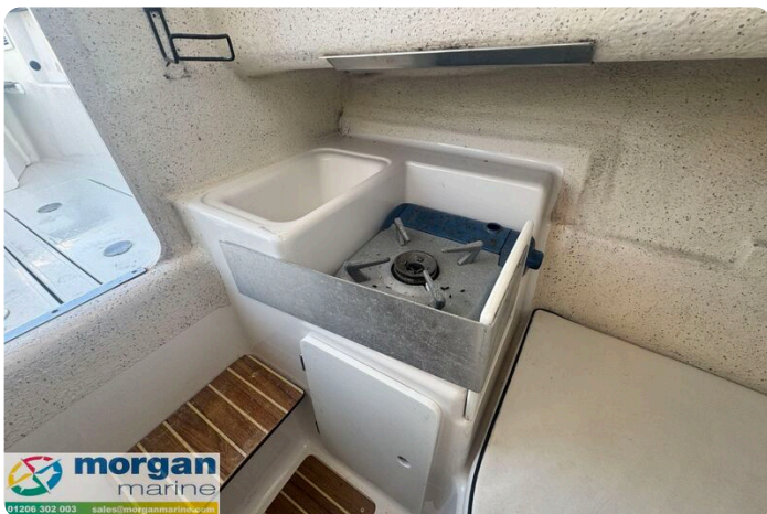
Quicksilver 640 - cooker