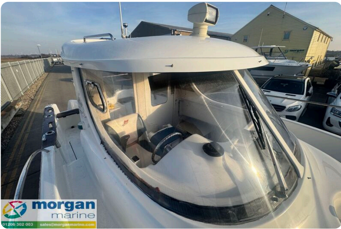
Quicksliver 640 - windscreen