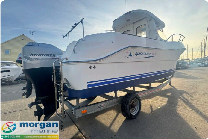
Quicksliver 640 - ladder