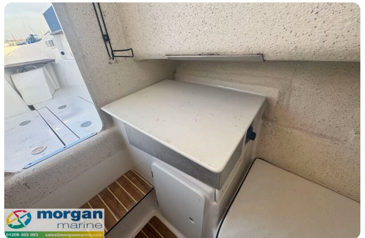
Quicksilver 640 - galley