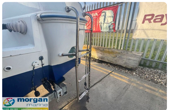
Quicksliver 640 - ladder