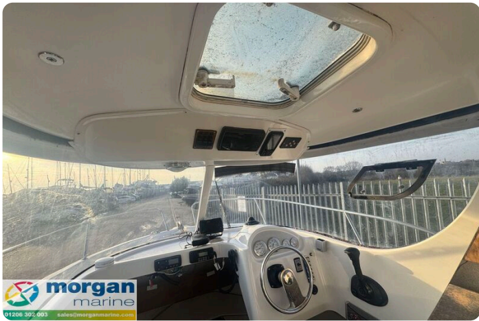
Quicksilver 640 - hatch