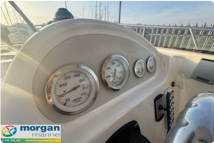
Quicksilver 640 - gauges