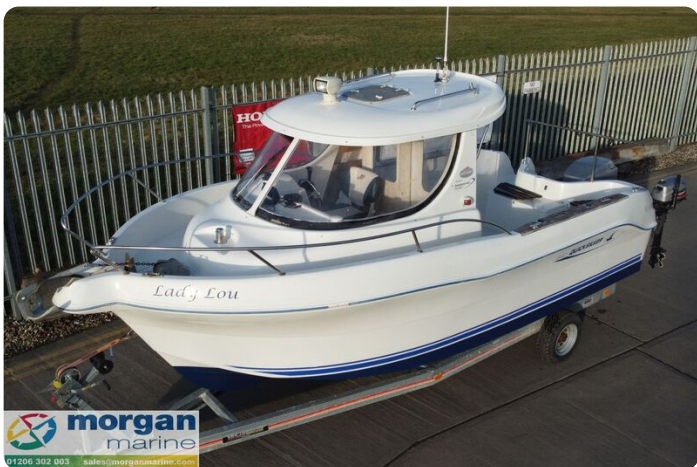
Quicksilver 640 - rails