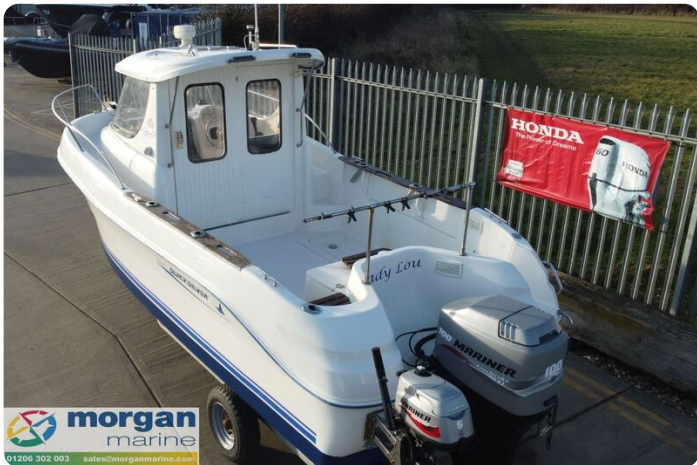
Quicksilver 640 - cockpit