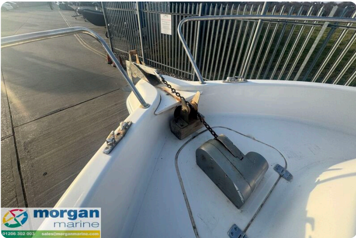
Quicksliver 640 - windlass