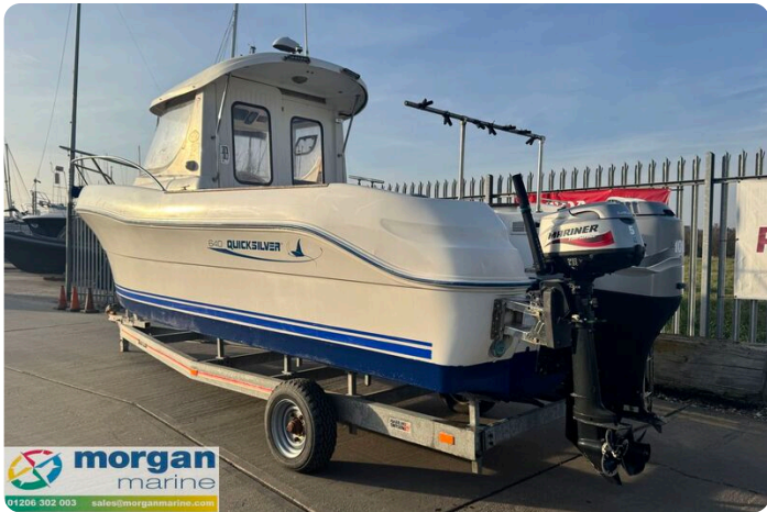
Quicksilver 640 - polished