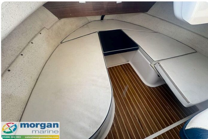
Quicksilver 640 - berth