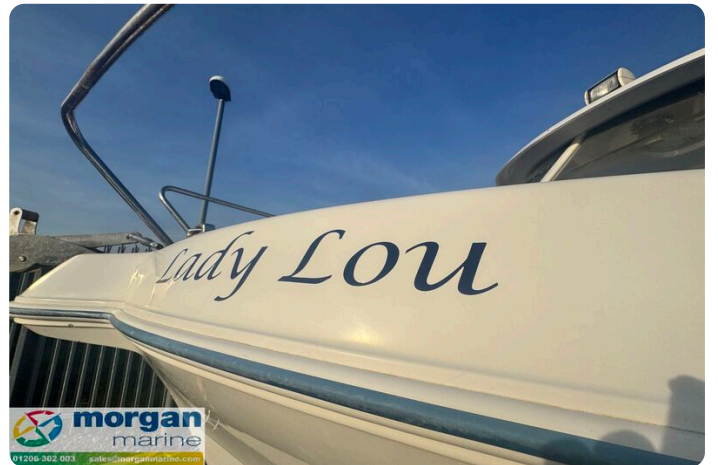
Quicksliver 640 - name