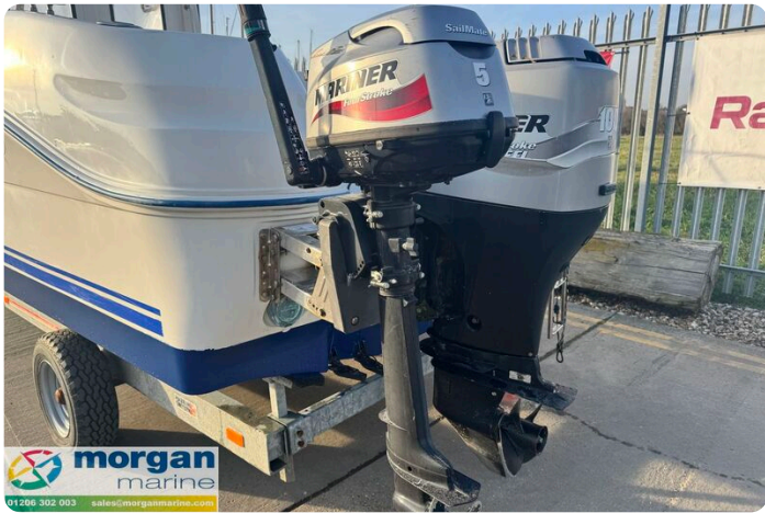
Quicksilver 640 - engine