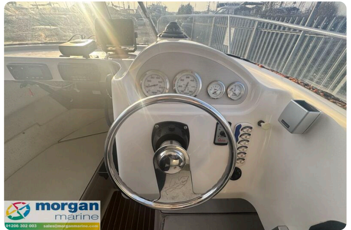
Quicksilver 640 - wheel