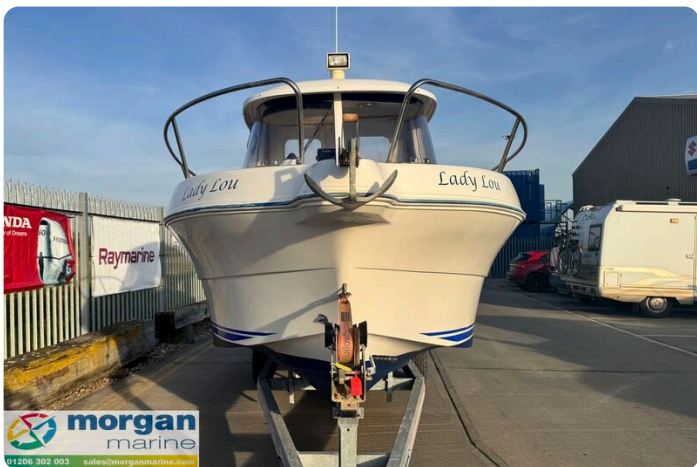
Quicksilver 640 - bow