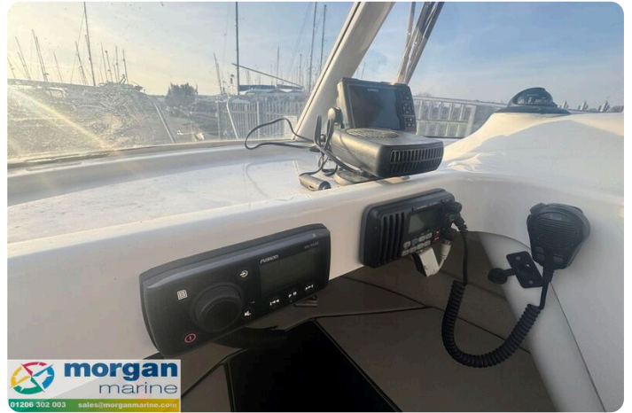
Quicksilver 640 - fusion