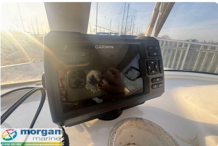
Quicksilver 640 - plotter