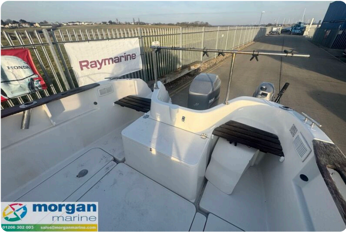
Quicksliver 640 - lockers