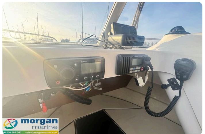
Quicksilver 640 - vhf