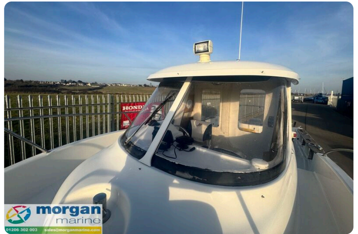
Quicksliver 640 - light