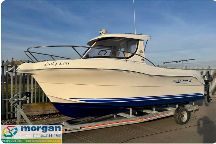
Quicksilver 640 - main picture