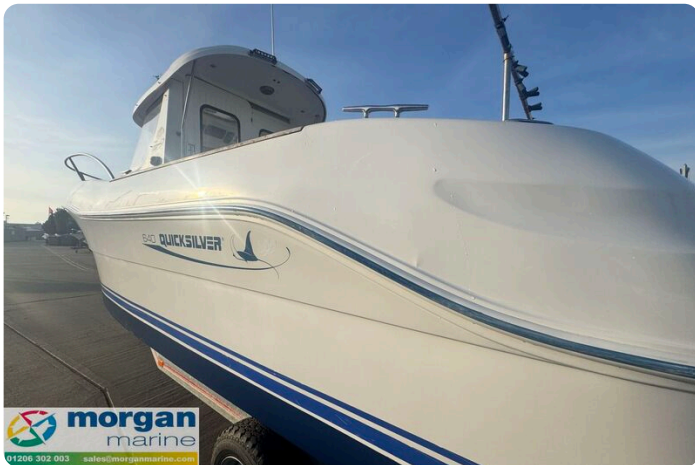
Quicksliver 640 - polished