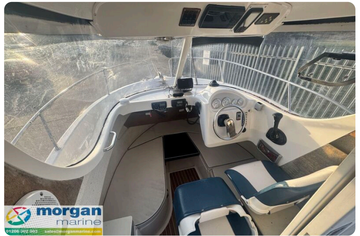
Quicksilver 640 - saloon