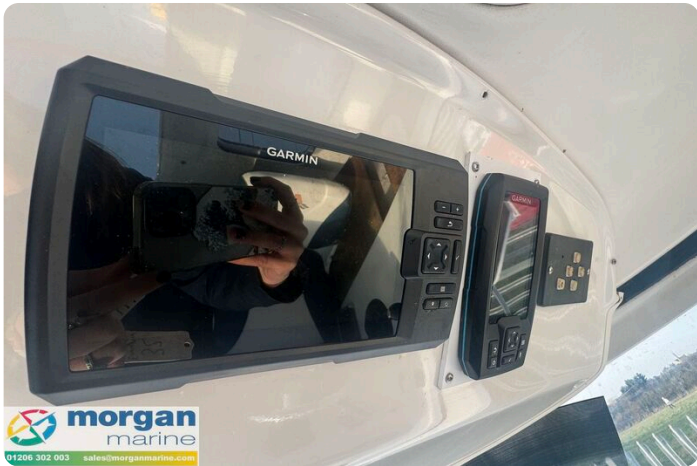
Quicksilver 640 - plotter