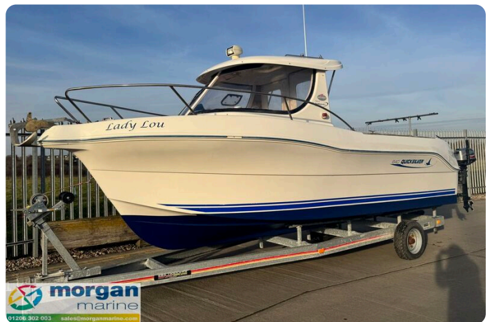
Quicksilver 640 - main photo