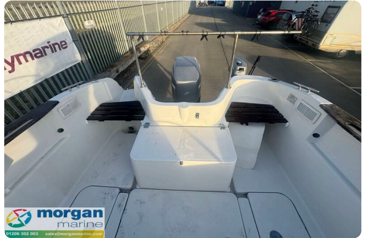
Quicksliver 640 - fishing