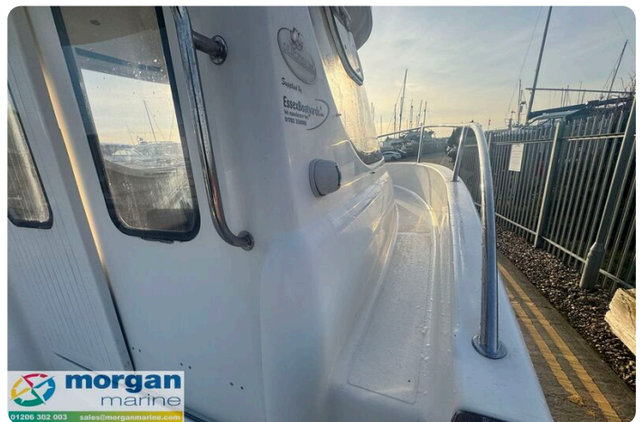
Quicksliver 640 - side walk