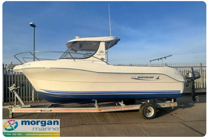
Quicksilver 640 - side