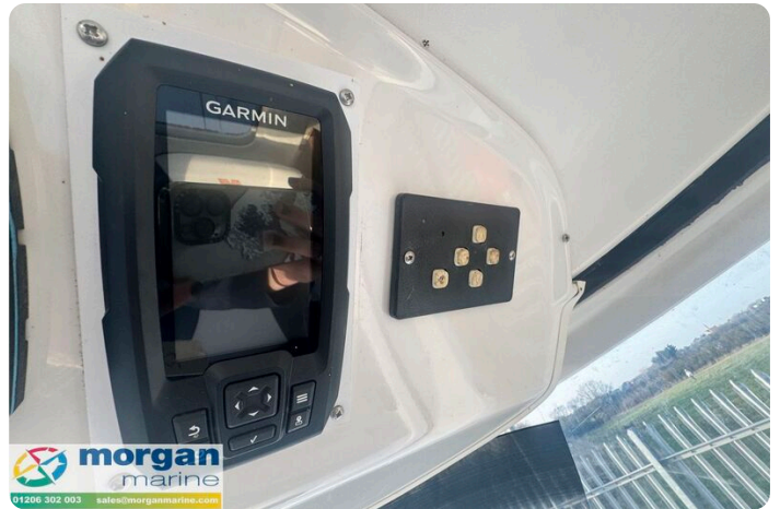
Quicksilver 640 - garmin