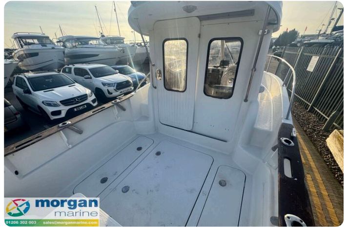
Quicksliver 640 - deck