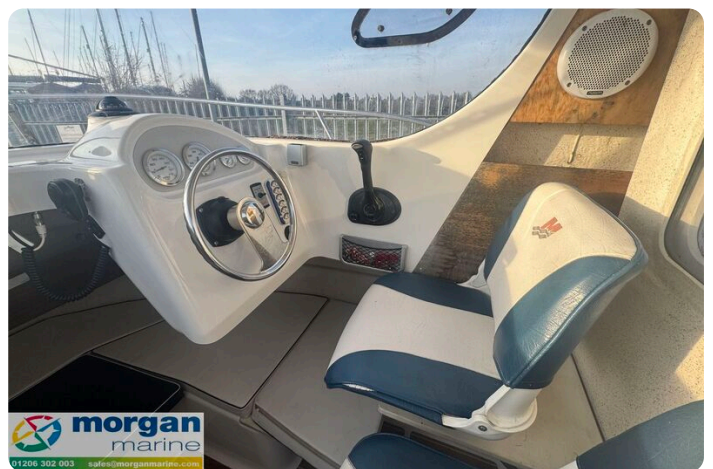
Quicksliver 640 - pilot seat