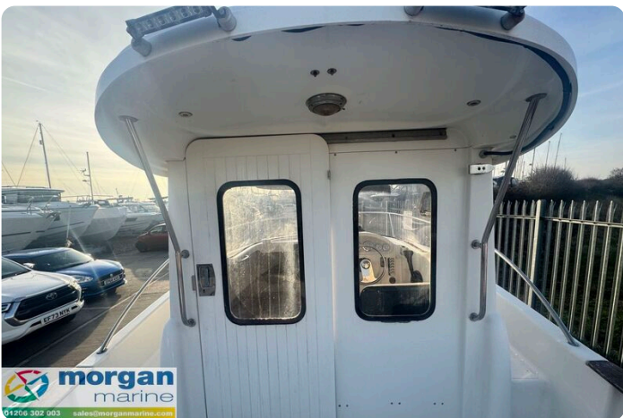
Quicksliver 640 - doors