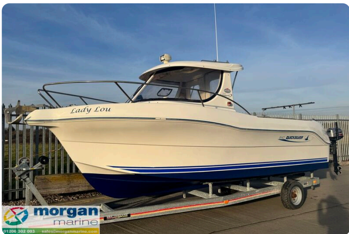
Quicksilver 640 - main