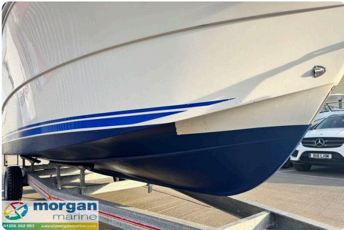
Quicksliver 640 - antifoul