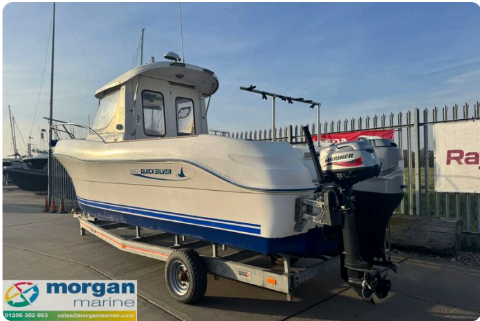
Quicksilver 640 - back