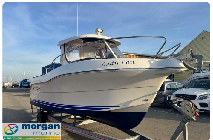
Quicksilver 640 - name