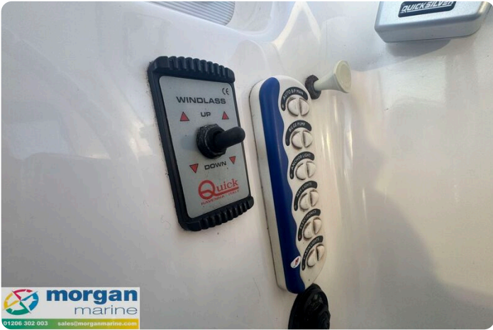
Quicksilver 640 - windlass