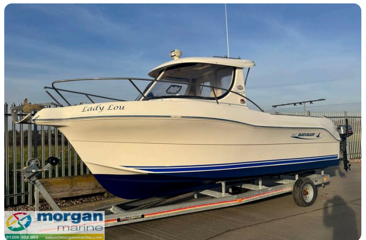
Quicksilver 640 - sideview