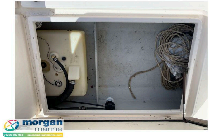
Quicksilver 640 - locker