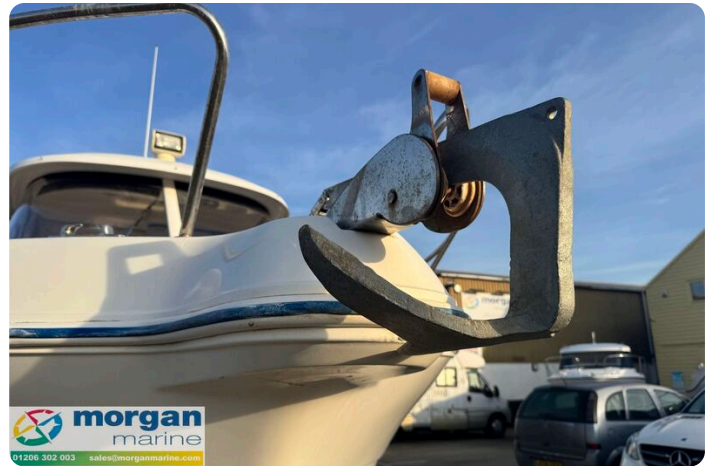
Quicksliver 640 - anchor