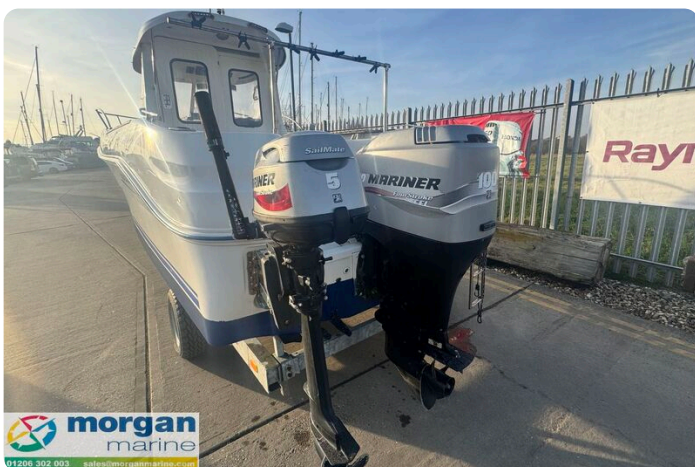
Quicksliver 640 - auxillary