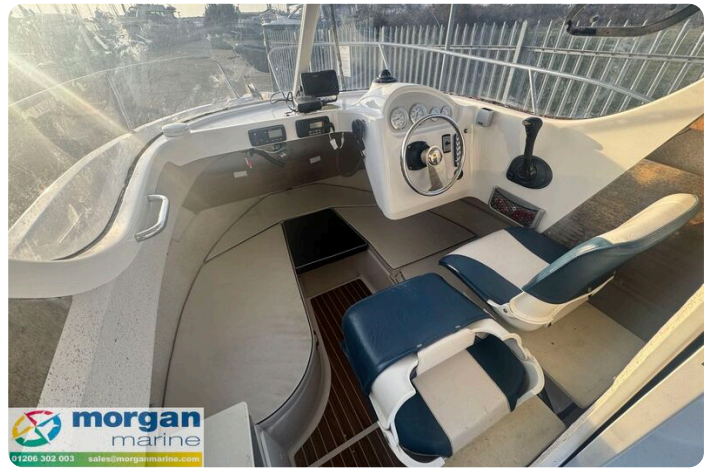
Quicksliver 640 - seating