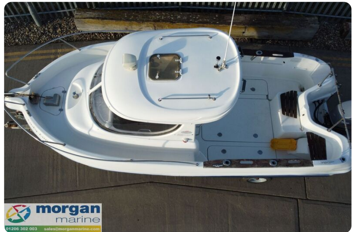
Quicksilver 640 - roof bars