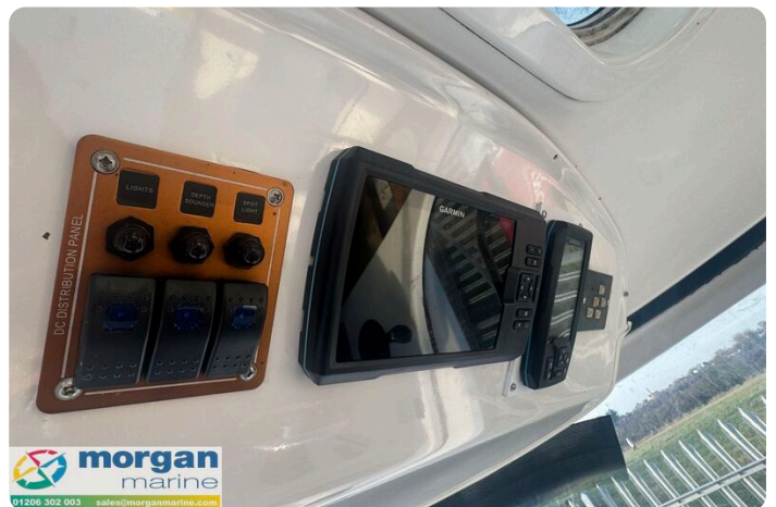
Quicksilver 640 - chart