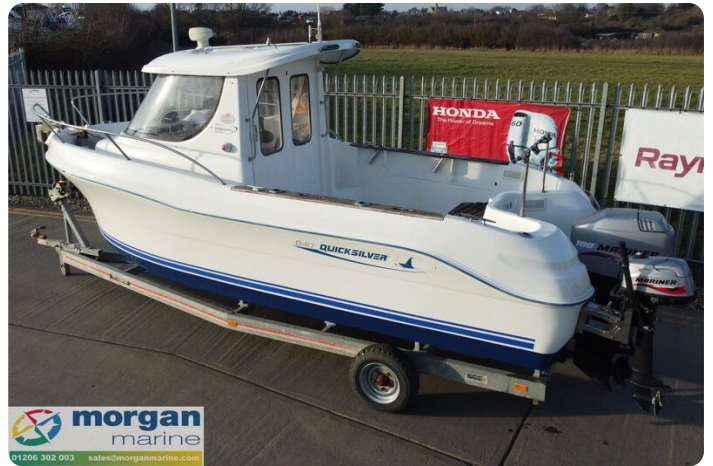
Quicksilver 640 - back