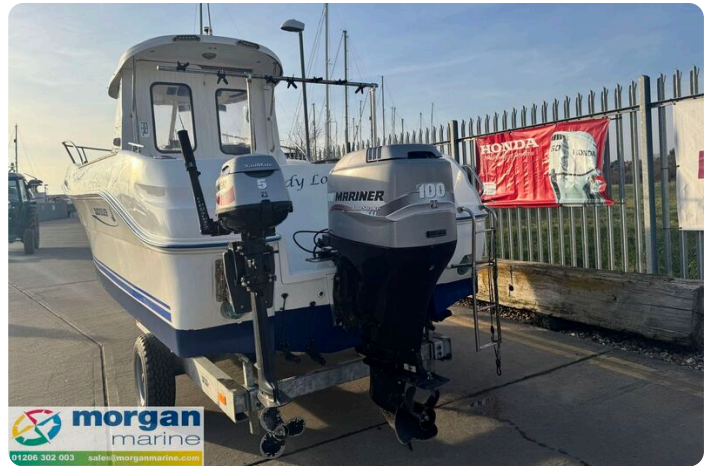
Quicksilver 640 - engine