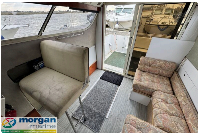
Relcraft Diamond Sedan 30 - pilot seat