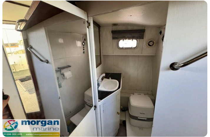
Relcraft Diamond Sedan 30 - mirror