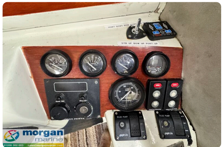
Relcraft Diamond Sedan 30 - trim tabs