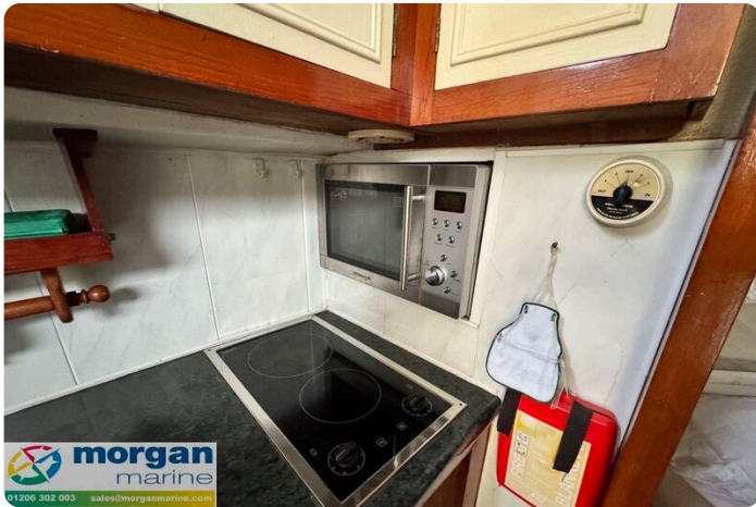
Relcraft Diamond Sedan 30 - cooker