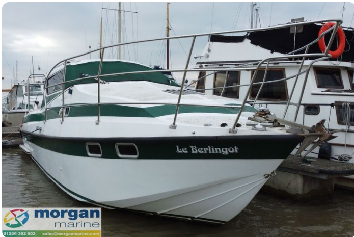
Relcraft Diamond Sedan 30 - bow view