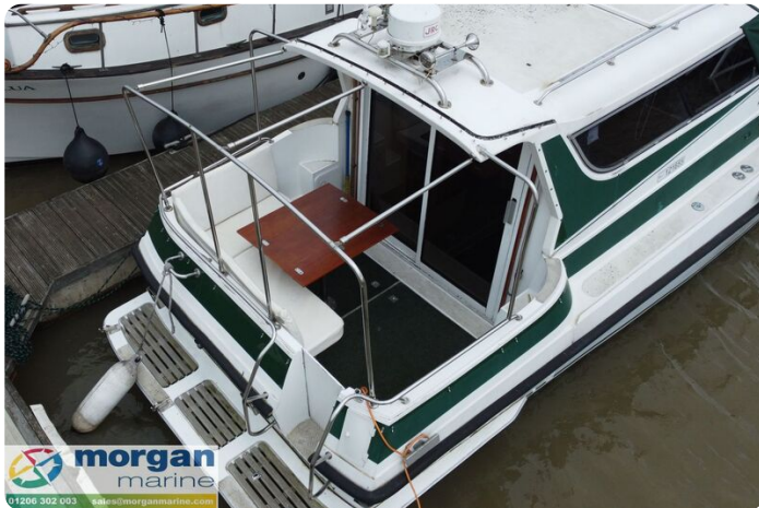
Relcraft Diamond Sedan 30 - canopy