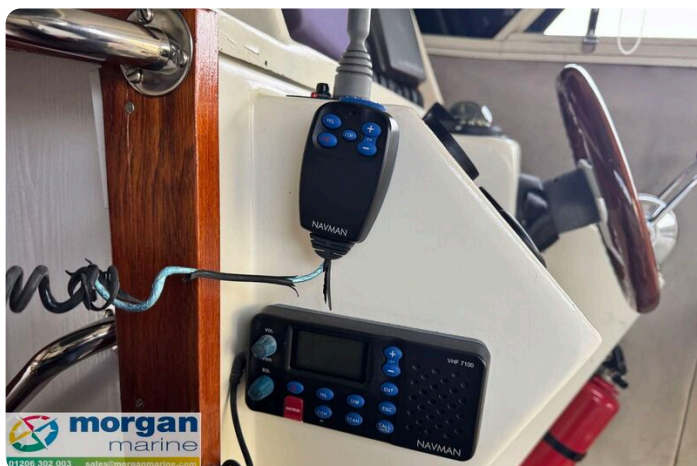
Relcraft Diamond Sedan 30 - vhf radio