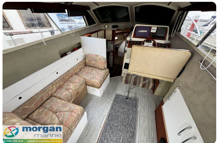
Relcraft Diamond Sedan 30 - saloon