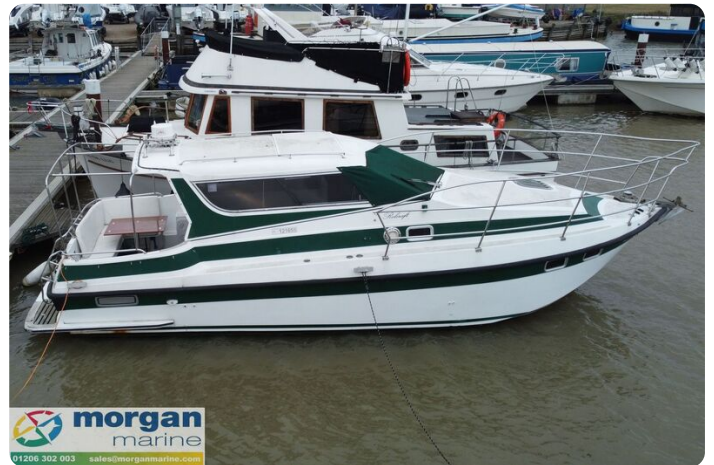
Relcraft Diamond Sedan 30 - side