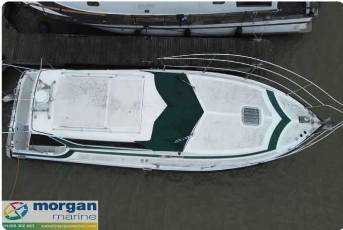
Relcraft Diamond Sedan 30 - top -view