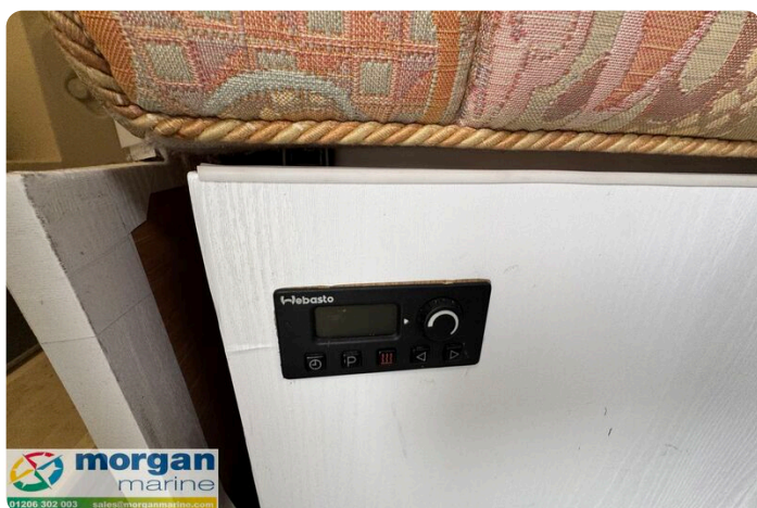
Relcraft Diamond Sedan 30 - heating