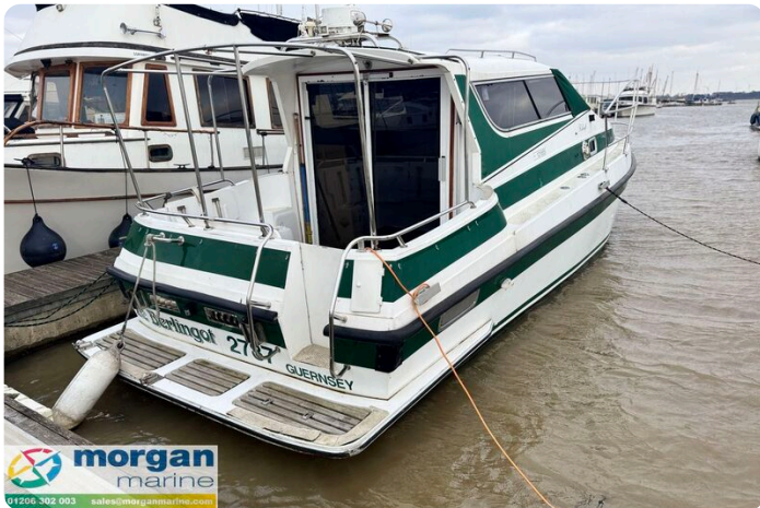
Relcraft Diamond Sedan 30 - back