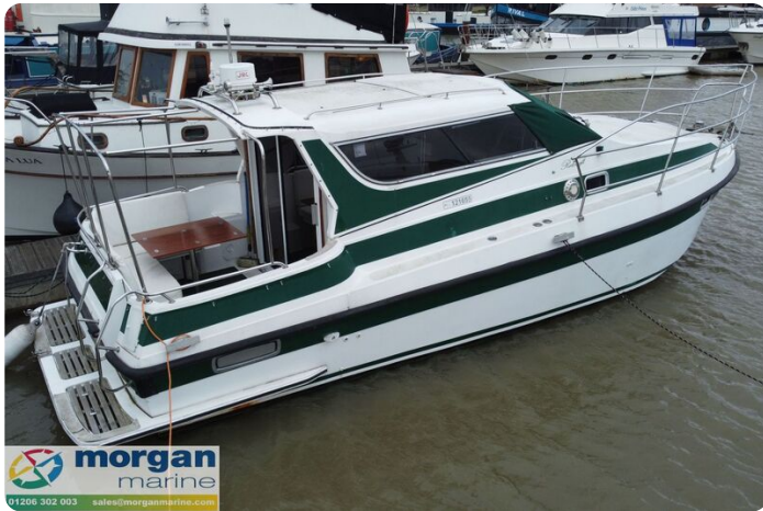
Relcraft Diamond Sedan 30 - back view