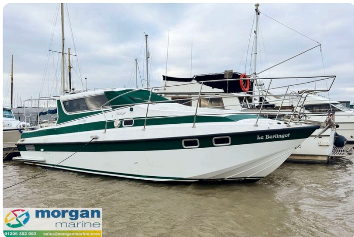
Relcraft Diamond Sedan 30 - main