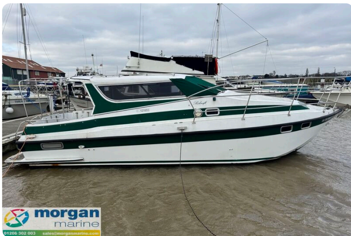
Relcraft Diamond Sedan 30 - side