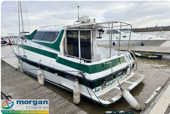
Relcraft Diamond Sedan 30 - fenders