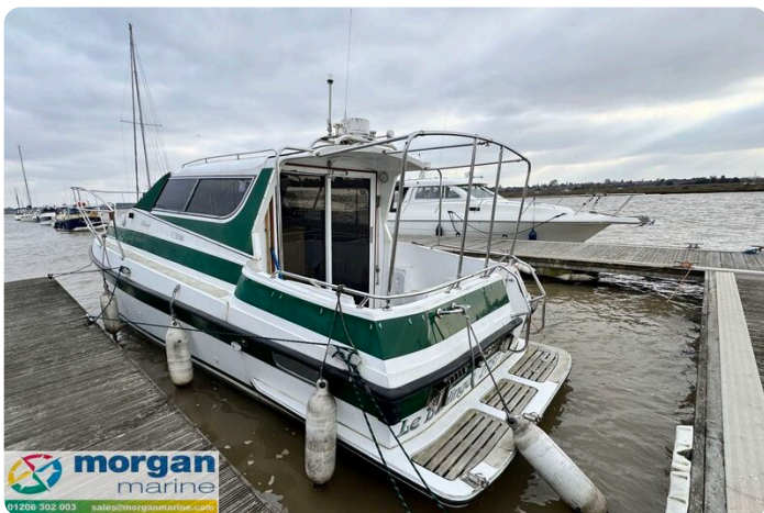
Relcraft Diamond Sedan 30 - bathing