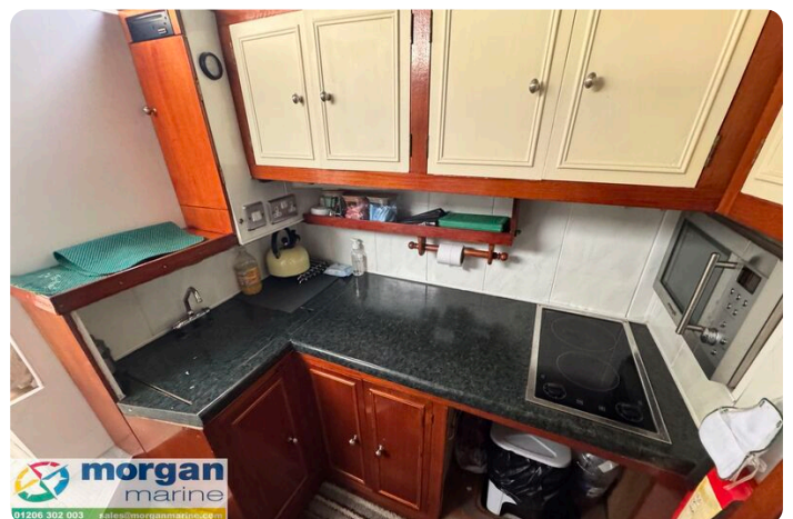
Relcraft Diamond Sedan 30 - kitchen