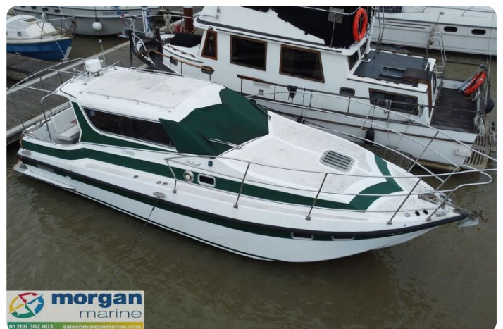
Relcraft Diamond Sedan 30 - bow