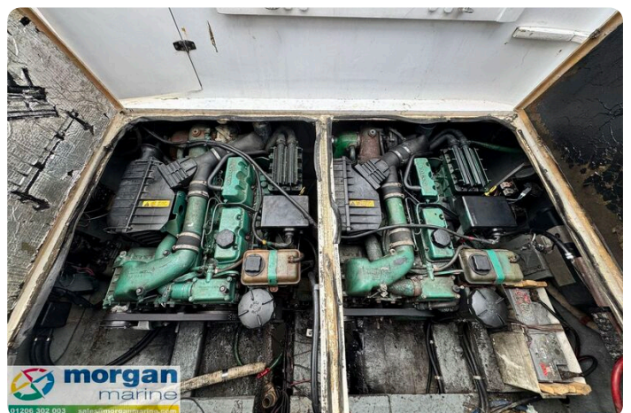
Relcraft Diamond Sedan 30 - engine