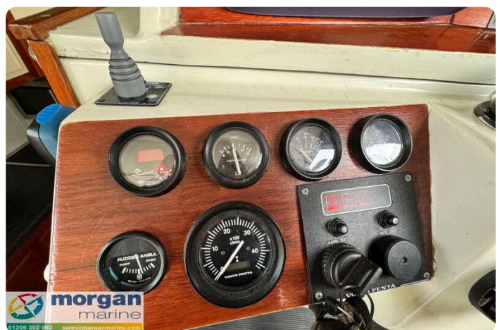
Relcraft Diamond Sedan 30 - thruster