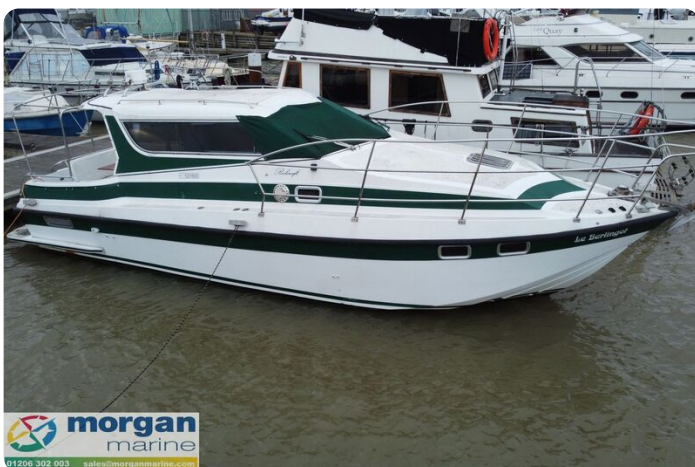
Relcraft Diamond Sedan 30 - rails