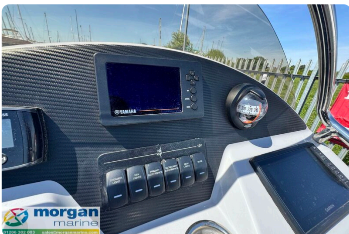
Ribeye S650 - compass