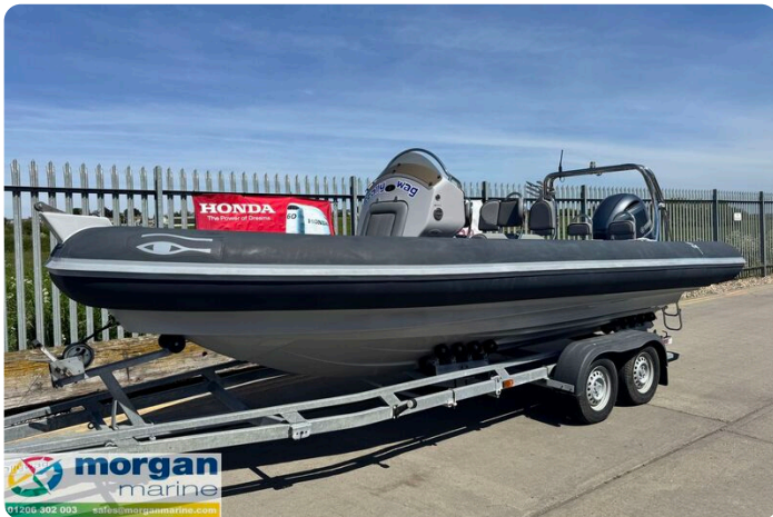
Ribeye S650 - Main