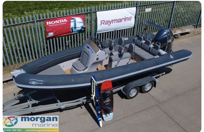
Ribeye S650 - overview