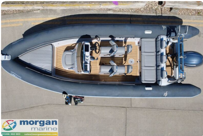
Ribeye S650 - top view