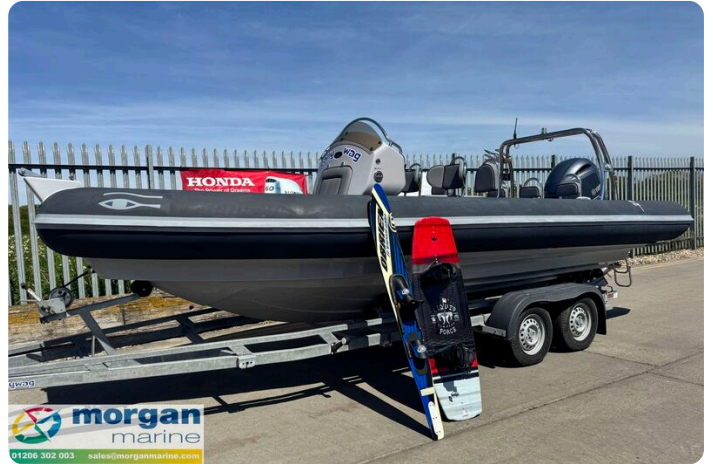
Ribeye S650 - wakeboard