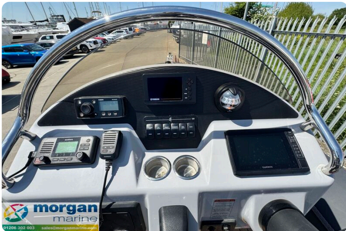
Ribeye S650 - dash