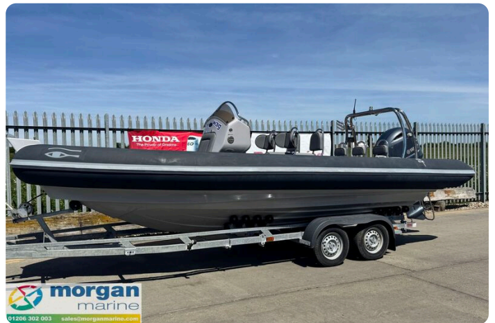
Ribeye S650 - trailer