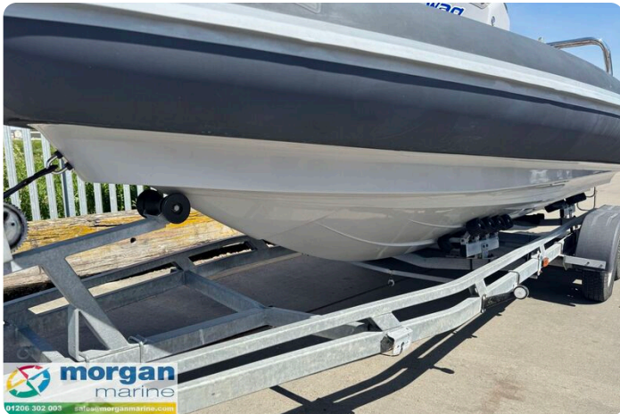
Ribeye S650 - hull