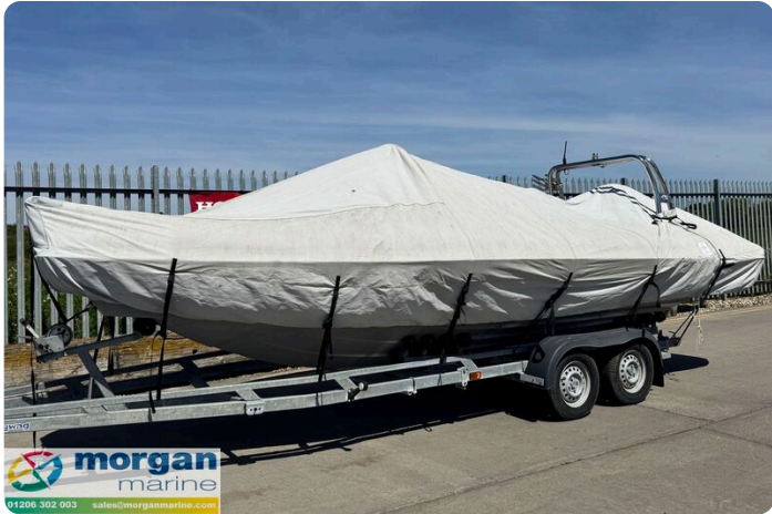
Ribeye 5650 - cover