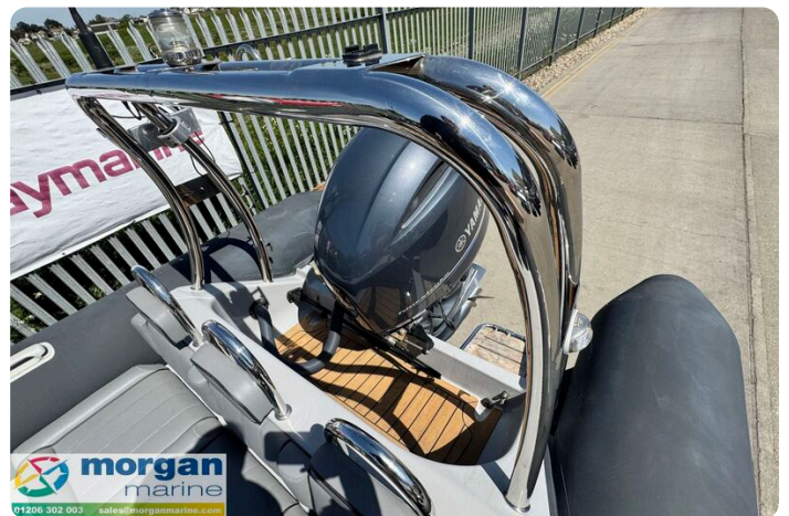
Ribeye S650 - aframe