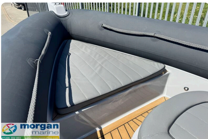
Ribeye S650 - bow seat