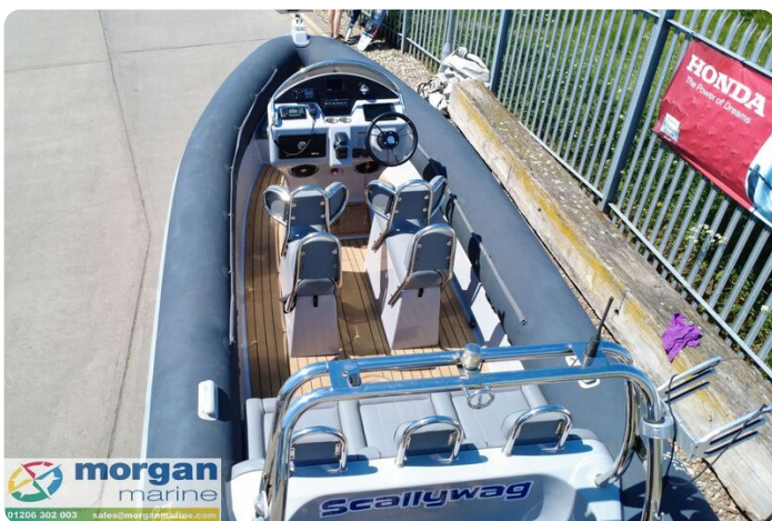
Ribeye S650 - overview