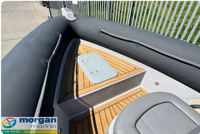
Ribeye S650 - bow locker