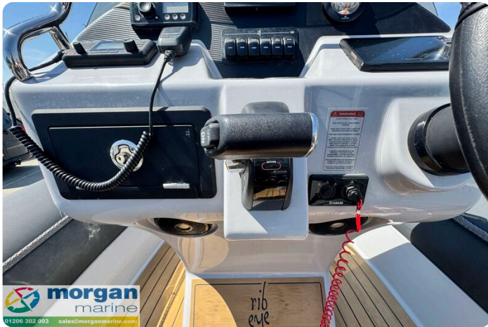
Ribeye S650 - Throttle