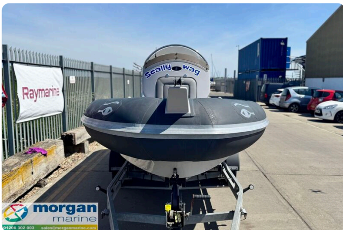
Ribeye S650 - bow