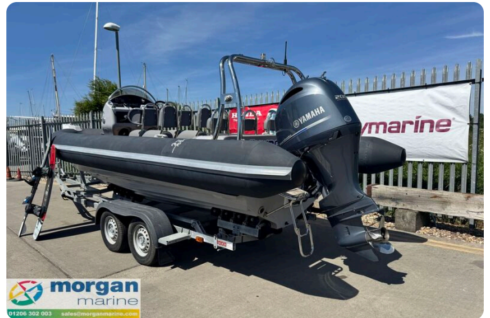
Ribeye S650 - ladder