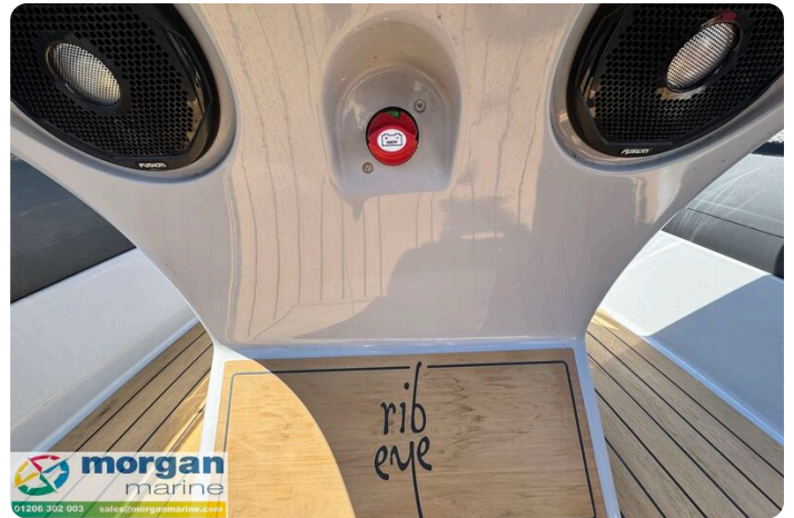
Ribeye S650 -isolator