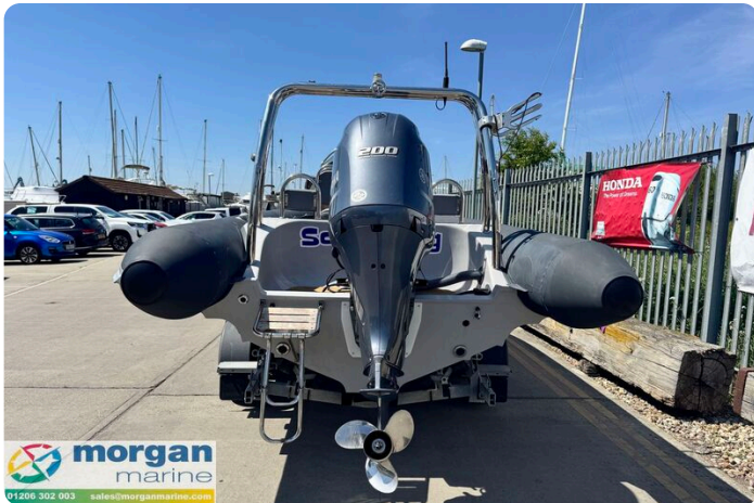
Ribeye S650 - engine