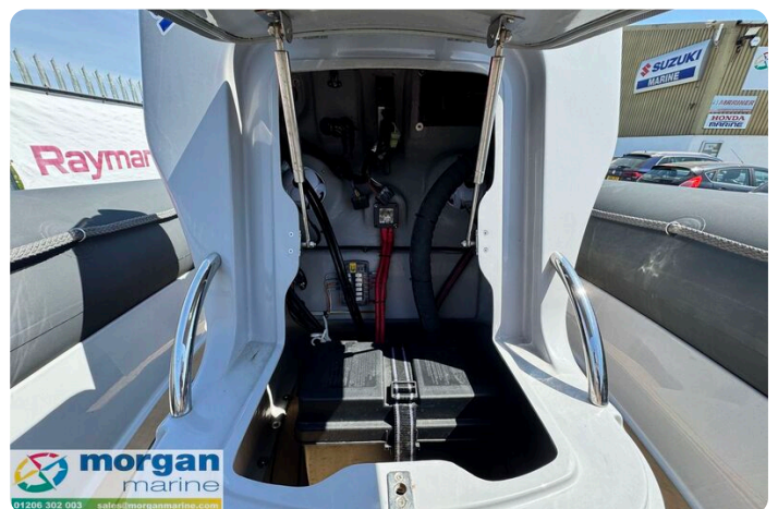
Ribeye S650 - console storage