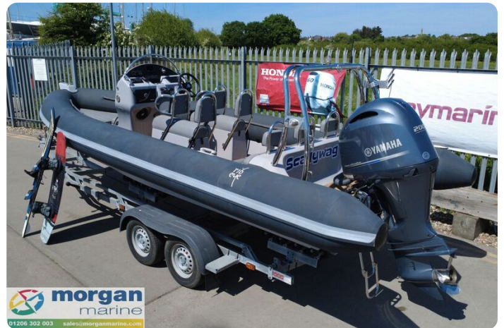
Ribeye S650 - aframe