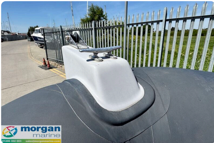
Ribeye S650 - cleat