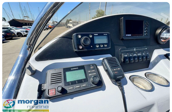
Ribeye S650 - VHF