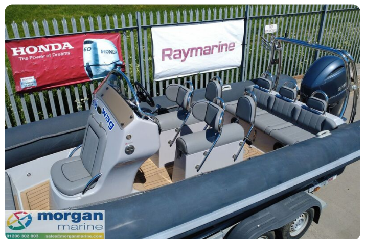
Ribeye S650 - backrests