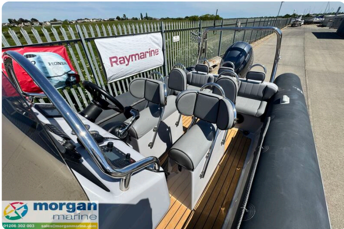
Ribeye S650 - jockeys