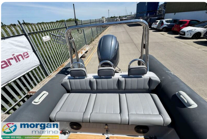
Ribeye S650 - bench seats