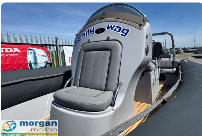
Ribeye S650 - console