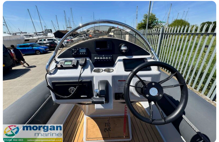
Ribeye S650 - console