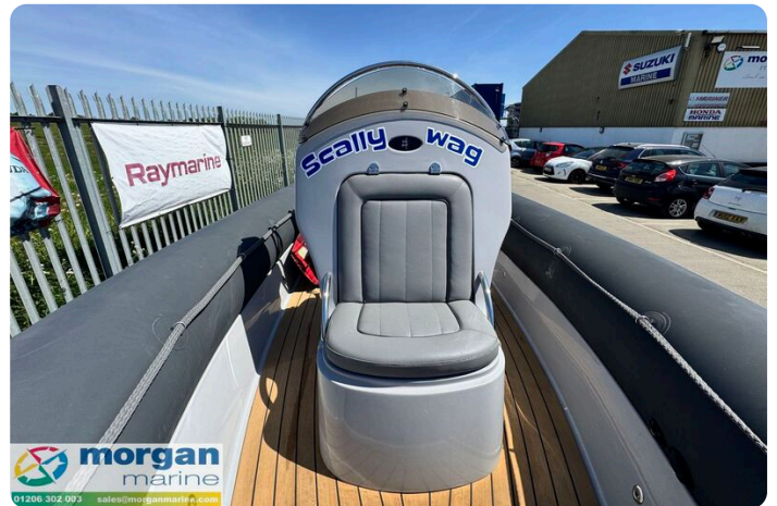
Ribeye S650 - console seat