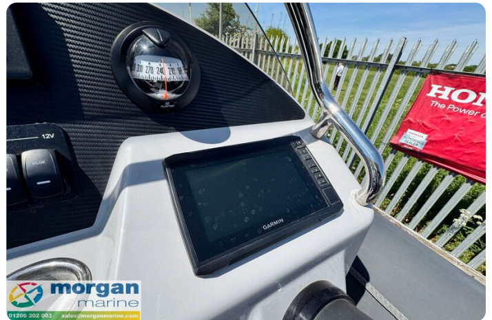
Ribeye S650 - plotter