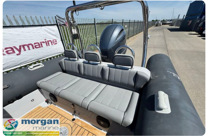
Ribeye S650 - bench seat