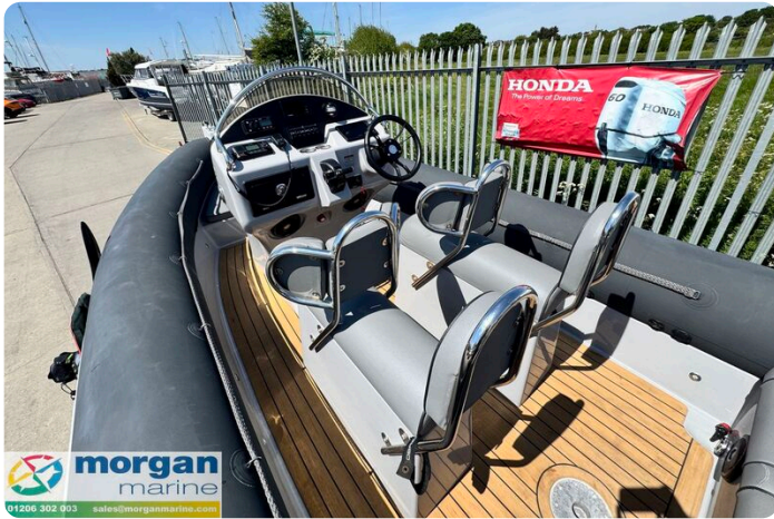
Ribeye S650 - jock seats