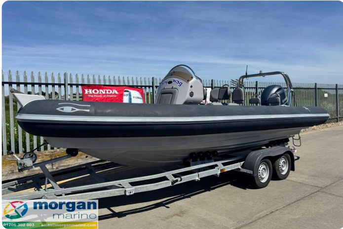
Ribeye S650 - side