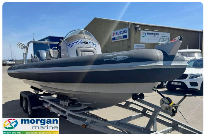
Ribeye S650 - bow