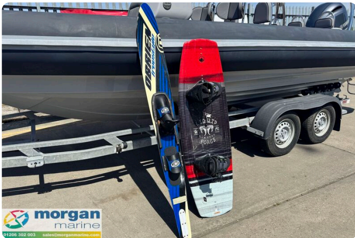
Ribeye S650 - wakeboard 1