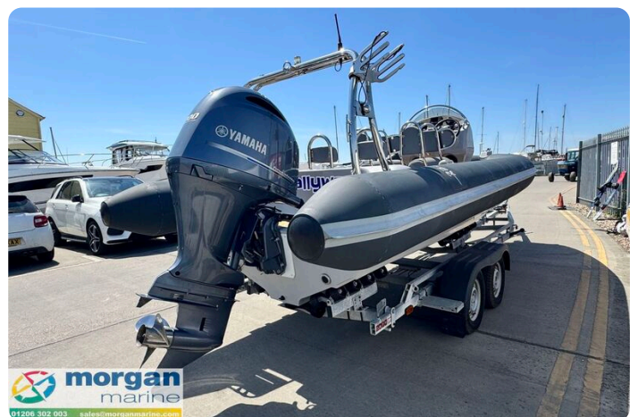
Ribeye S650 - side of engine