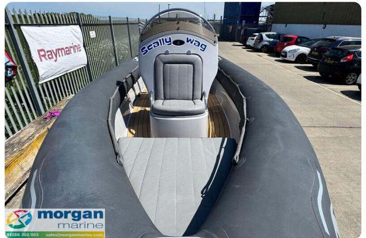
Ribeye S650 - bow view