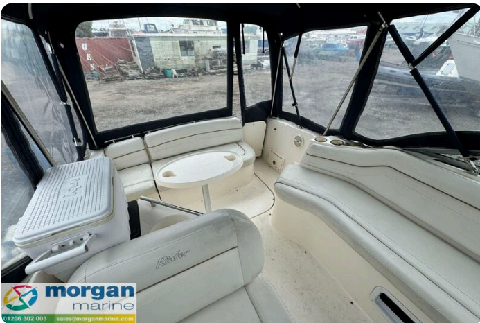
Rinker fiesta vee 250 boat - cockpit seating from helm