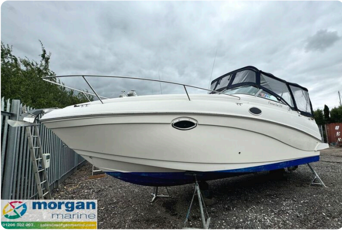
Rinker fiesta vee 250 boat