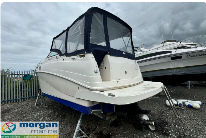
Rinker fiesta vee 250 boat - bathing platform and entrance to cockpit