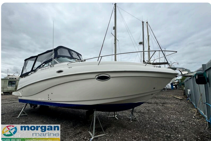
Rinker fiesta vee 250 boat - starboard side bow