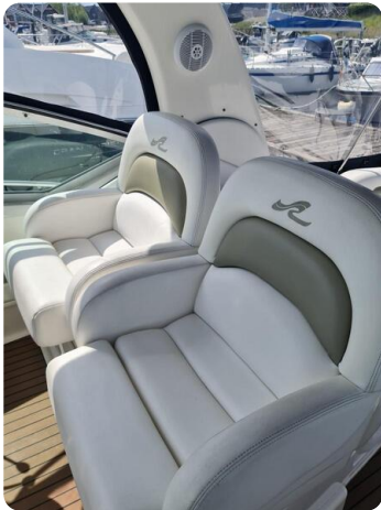
Sea Ray 375 Sundancer Twin Diesel