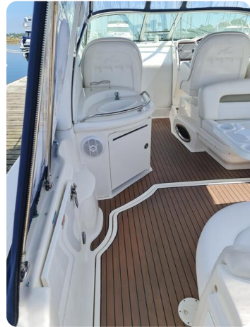
Sea Ray 375 Sundancer Twin Diesel