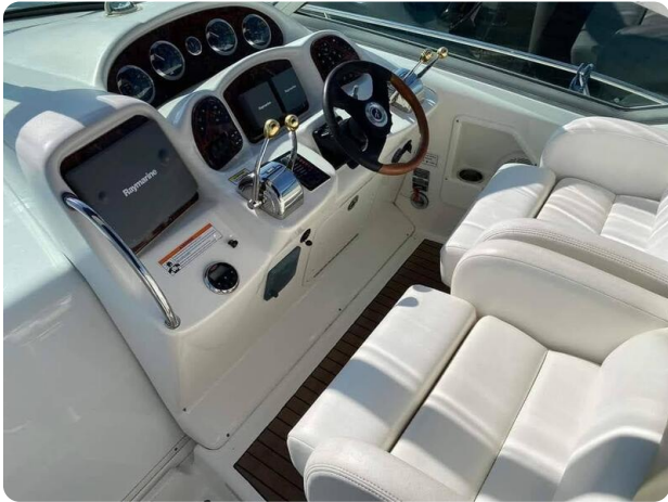
Sea Ray 375 Sundancer Twin Diesel