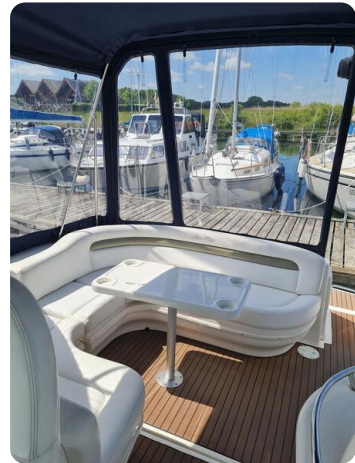
Sea Ray 375 Sundancer Twin Diesel