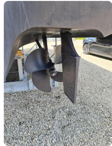
Sea Ray 375 Sundancer Twin Diesel