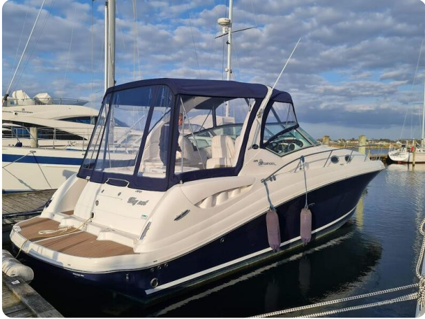
Sea Ray 375 Sundancer Twin Diesel