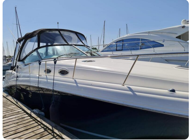
Sea Ray 375 Sundancer Twin Diesel