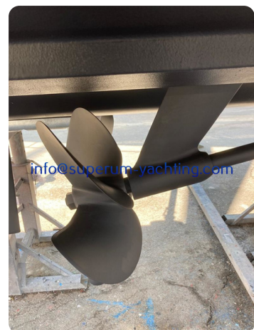
prop and shaft Velox treated