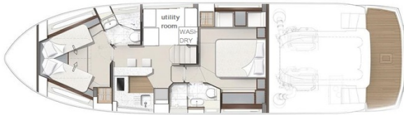
PRED50 lower deck w. utility room