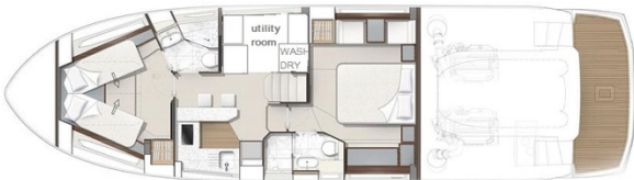
PRED50 lower deck w. utility room