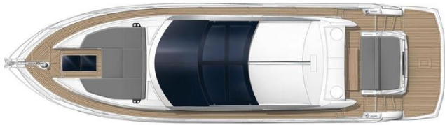
PRED50 upper deck