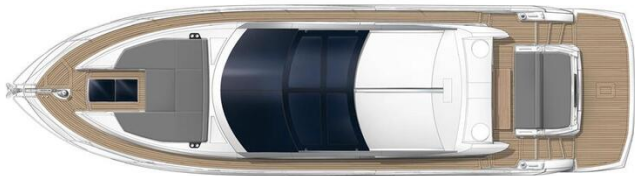
PRED50 upper deck