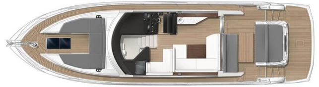
PRED50 main deck