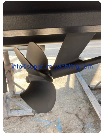
prop and shaft Velox treated