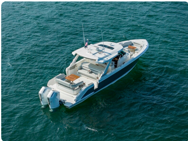
Tiara 43LS aerial