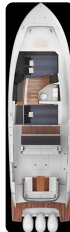
Tiara 43 LS interior layout