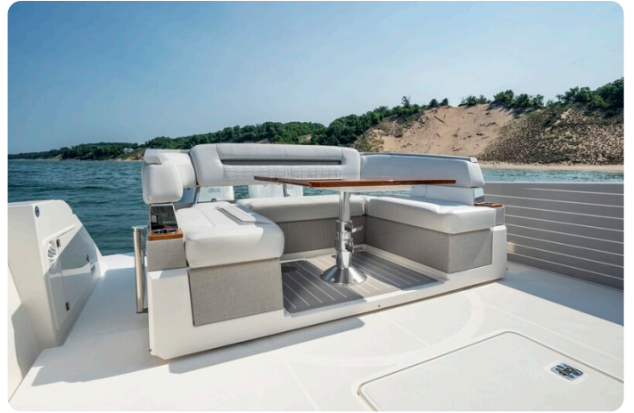
Tiara 43LS cockpit dinette