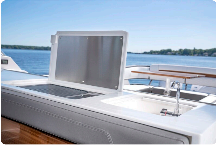
Tiara 43 LS galley