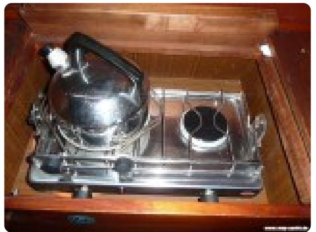
Vindö 50 msp269542 5