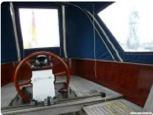
Vindö 50 msp269542 4