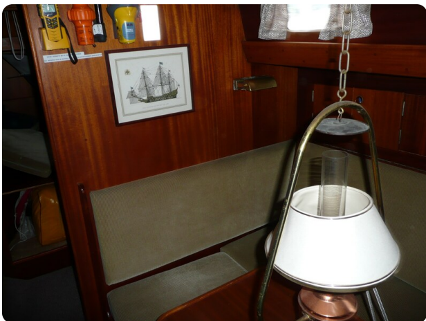
Vindö 50 msp269542 10