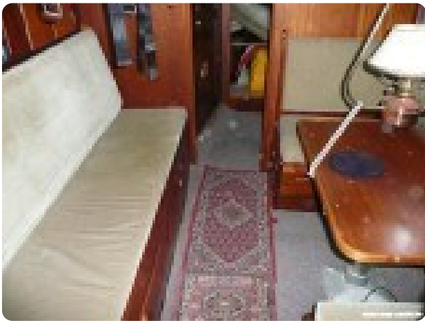
Vindö 50 msp269542 8