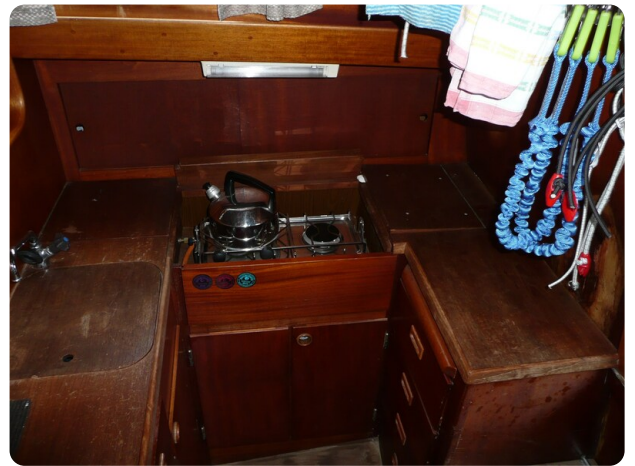
Vindö 50 msp269542 9