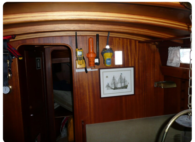
Vindö 50 msp269542 11